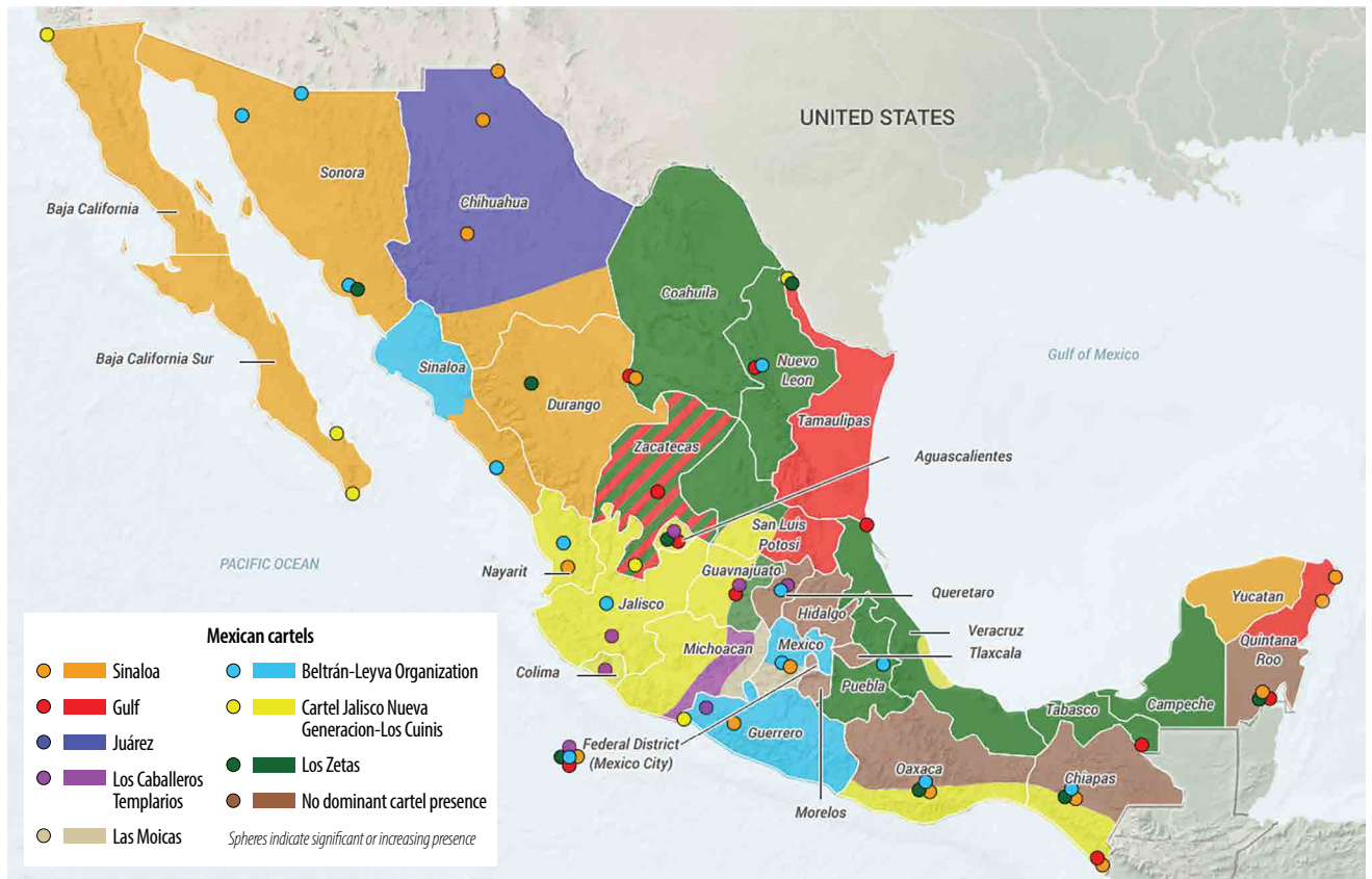
(Figure courtesy of Geopolitical Futures ©2018, https://www.geopoliticalfutures.com . Source: U.S. Congressional Research Service/Drug Enforcement Administration 2015)