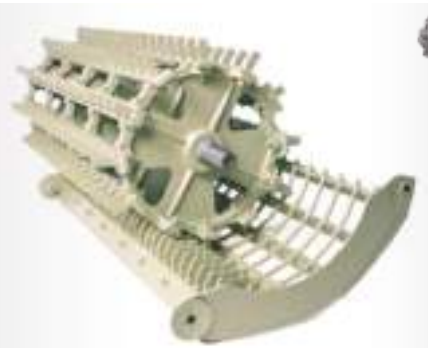
Rice cylinder and concave option