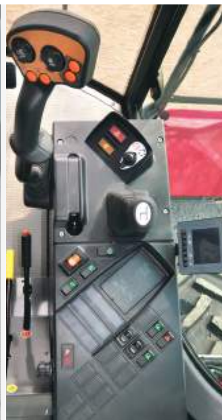
Main control dashboard

The Elegance cab is designed to give the operator an ideal and productive working environment. It brings together excellent convenience with perfect comfort, even after many hours at work.