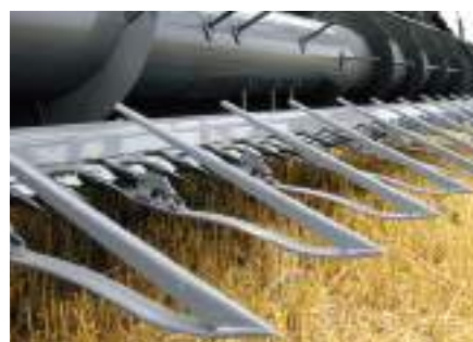
Freeflow table with crop lifters