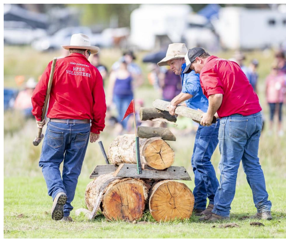
MFSR Challenge (Cross Country) - Logistics

MFSR Volunteers contribute to the success of our Festival. Man From Snowy River Bush Festival fully endorses that all MFSR Volunteers are not deprived of their basic human rights.