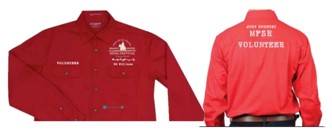
2021 MFSR Volunteer Uniform Sponsored by Just Country Australia Pty Ltd

It is highly recommended that sun protection headwear be worn when performing official MFSR Volunteering duties outdoors. The Festival provides access to sunscreen at the MFSR Volunteer Refreshment Centre.