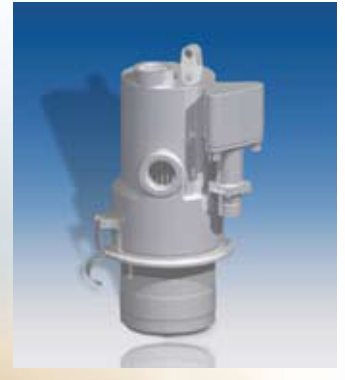
TV3-117 Engine Lube System

The differential pressure indicator actuation setting has been adjusted to provide additional time between filter differential pressure indication and actual filter element by-pass. Compared to the original filter system, this allows sufficient time for completion of the flight without having to abort and land immediately.