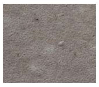
Mi-8/17 helicopter main gearbox.

Typical lube oil condition after few hours of operation with new oil.