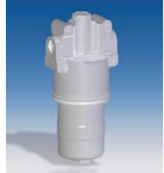
Mi8/17 Hydraulic filter assemblies

For the latest generation of Mi-8/17 family (Mi-171A2), a new hydraulic filter assembly and a reservoir breather are being introduced by Pall Aerospace. They are also available to retrofit the existing fleet.