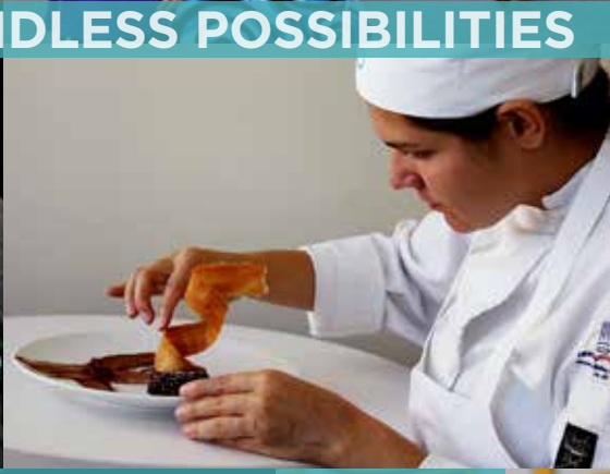
300 PROGRAMS AND PATHWAYS • 8 CAMPUSES • ATHLETICS • STATE-OF-THE-ART TECHNOLOGY