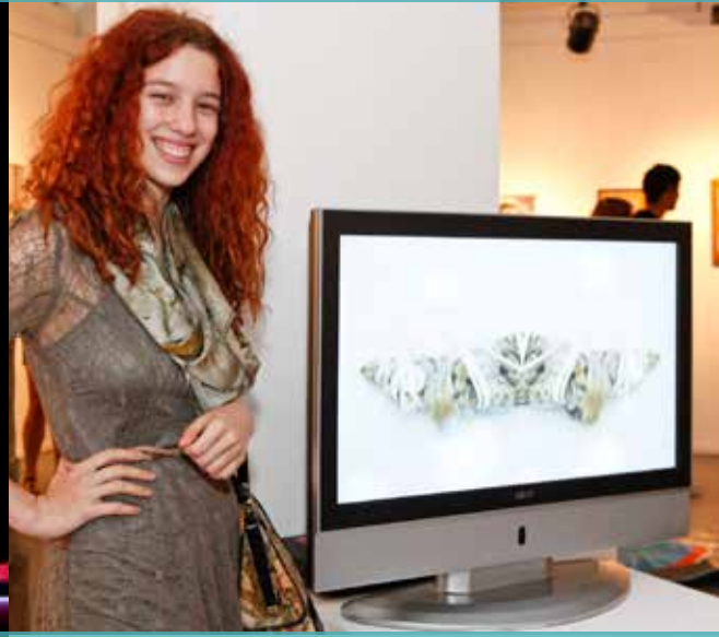
STUDENT LIFE • NOTABLE ALUMNI • ENDLESS POSSIBILITIES