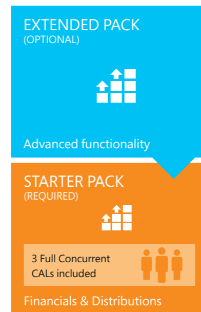
Figure 4: Extended Pack

The first three Full Users included in the Start Pack get to access to all of the incremental functionality.