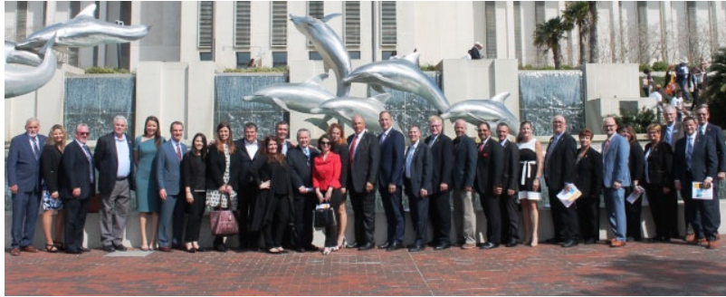
CFHLA Tourism Day Delegation in front of the Florida State Capitol Building