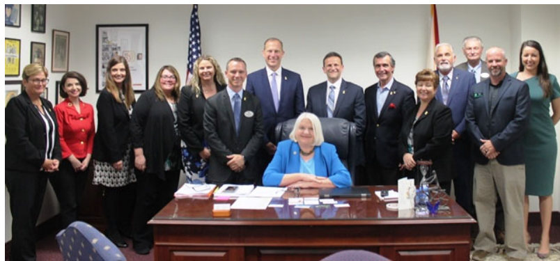
CFHLA Tourism Day Delegation with Senator Linda Stewart (District 13)