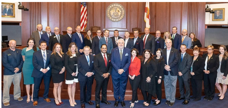
CFHLA Tourism Day Delegation Members in the Senate Chamber