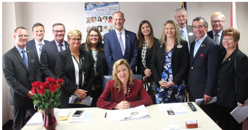
CFHLA Tourism Day Delegation with Representative Joy Goff-Marcil (District 30)