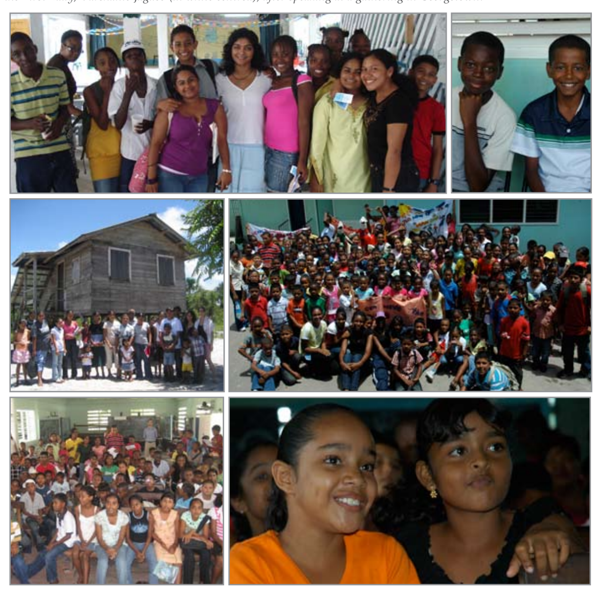
(PHOTO BELOW) the First Lady, Varshanie Jagdeo (in white centred), after speaking at a gathering in Georgetown.

activity, which may include dance, drama, singing or painting. Finally, the youth Animators and participants lead small groups in structured discussions of the social issues that are featured in the Animators' manual. The group usually closes with a period of reflection and sharing of what they learned during the day.