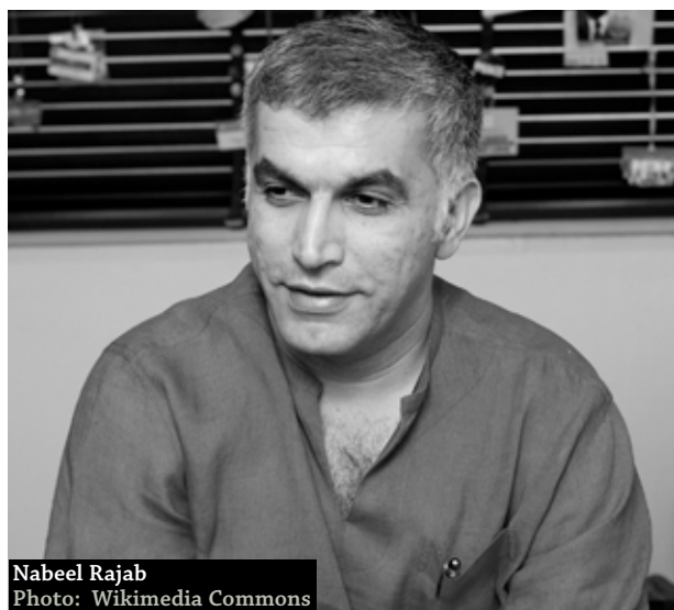
Nabeel Rajab