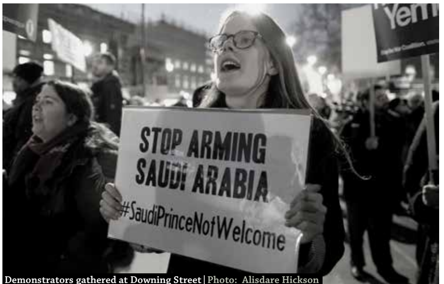
Demonstrators gathered at Downing Street

The same day as the protest against the welcoming of Mohammad bin Salman at Downing Street, the British corporate owned mainstream media embarked on a massive campaign to