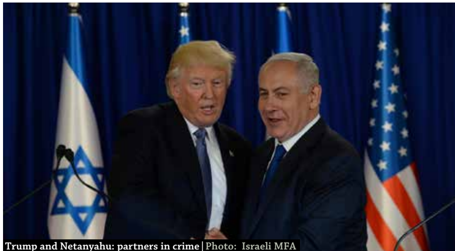
Trump and Netanyahu: partners in crime