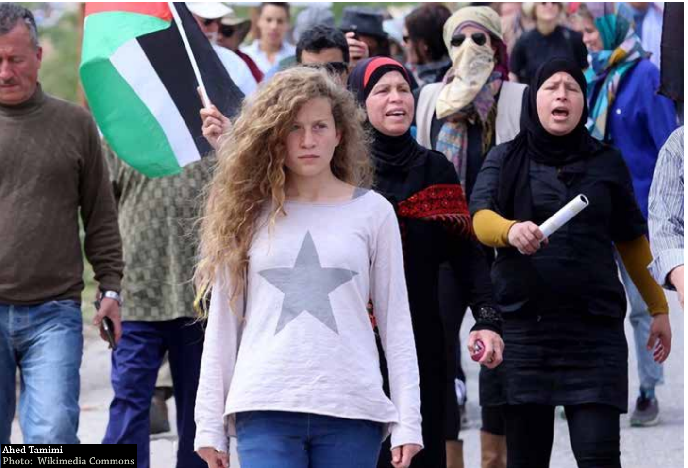
Ahed Tamimi

'Area C' would make a future Palestinian state in the West Bank impossible.