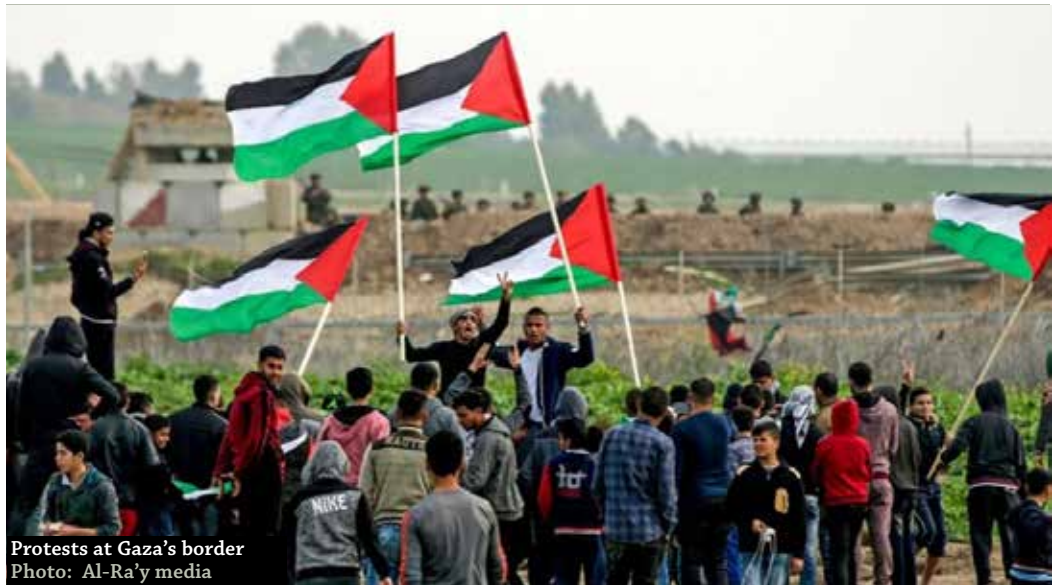
Protests at Gaza's border

Israeli spokesmen portray the protests as a "terrorist" threat, organised by militant group Hamas. Yet the tally of casualties (see box, right) tells a different story. According to