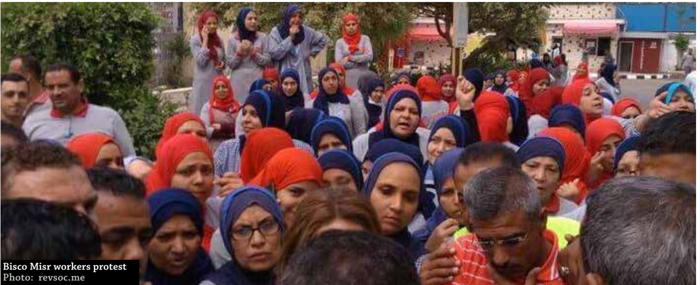
Bisco Misr workers protest