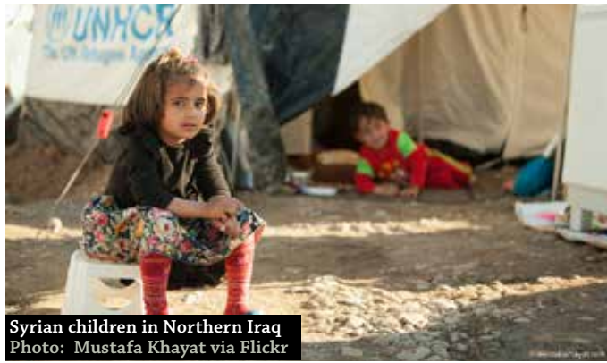
Syrian children in Northern Iraq

Just two weeks after hundreds of cruise missiles pounded regime bases in retaliation for horrific attacks on besieged civilians where chemical weapons are likely to have been used,