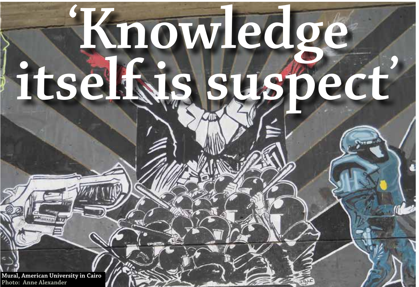
Mural, American University in Cairo