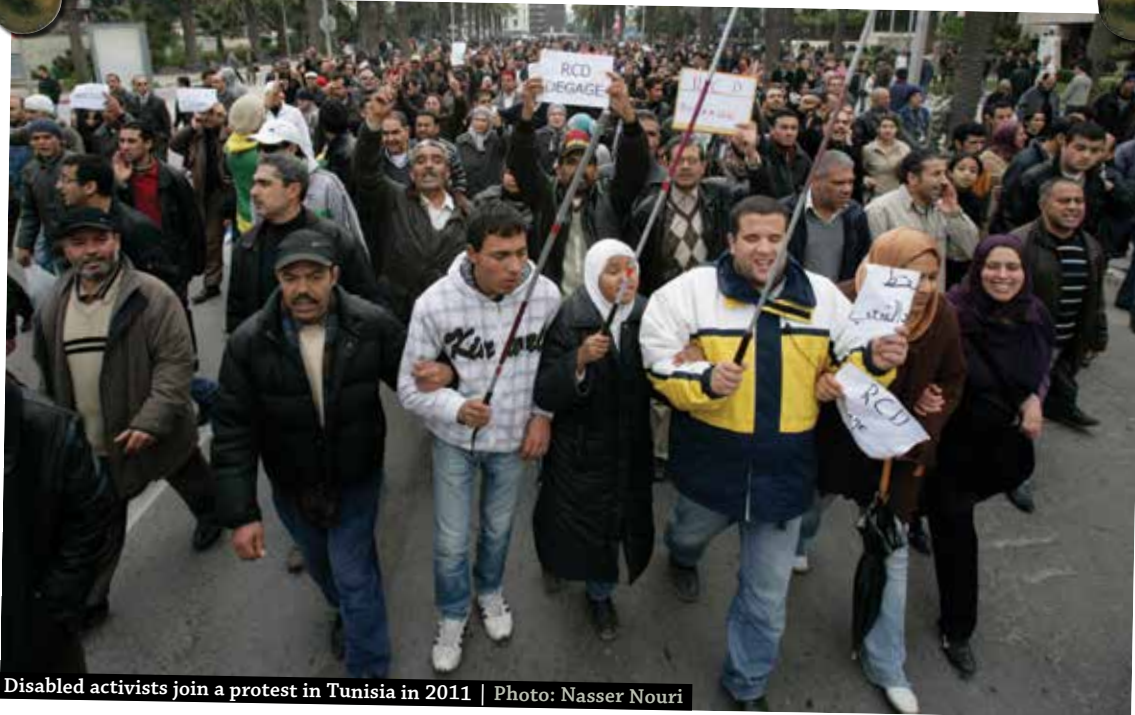
Disabled activists join a protest in Tunisia in 2011