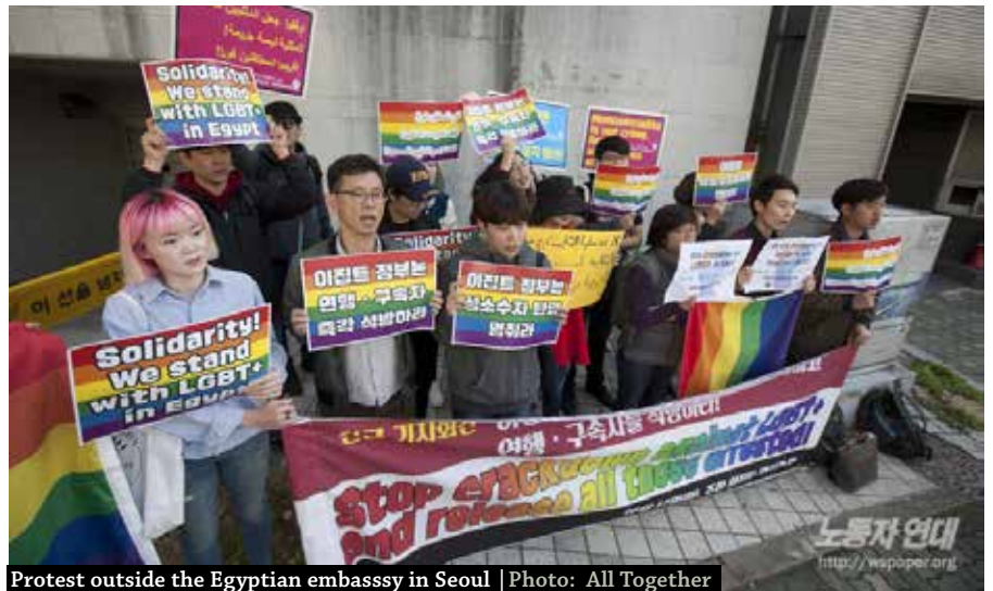
Protest outside the Egyptian embassy in Seoul

LGBT+ communities, progressive parties, labour organisations and student societies in South Korea demonstrated against the Egyptian government's repression toward LGBT+ outside the Egyptian embassy in South Korea on 17 October in response to the call from NGOs in Egypt for solidarity.