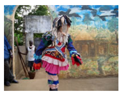
Image 2: Masked Dancer from Sierra Leone

We are focusing on West Africa because of its historical influence on the Americas since the era of the Trans-Atlantic slave trade. The merciless one-way passage for Africans over two hundred years ago has led to an ongoing cultural dialogue between the two continents, as you will read.