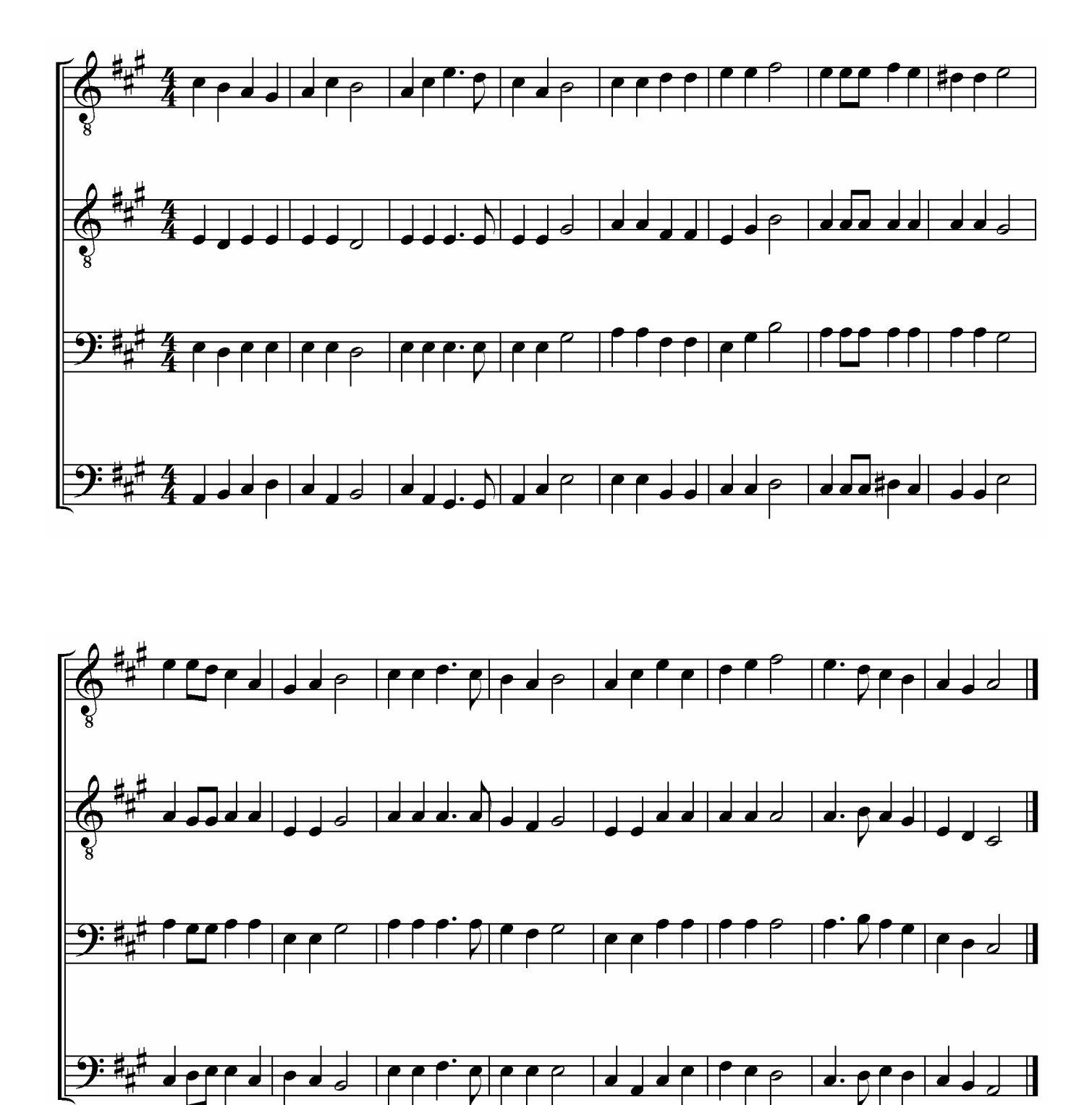
Three-Part Male (TTB – Men singing the middle part can read either the 2<sup>nd</sup> or 3<sup>rd</sup> line)