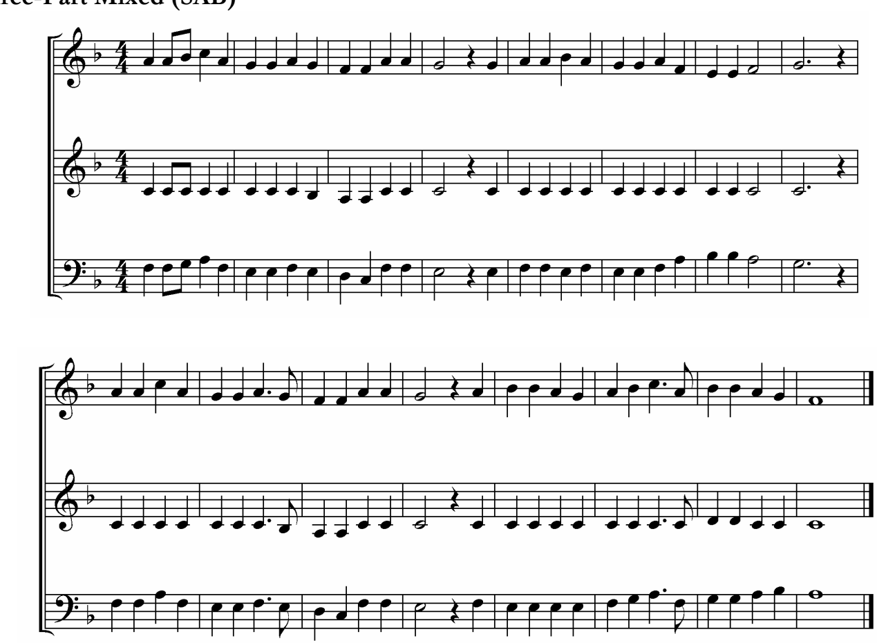
Three-Part Mixed (SAB)