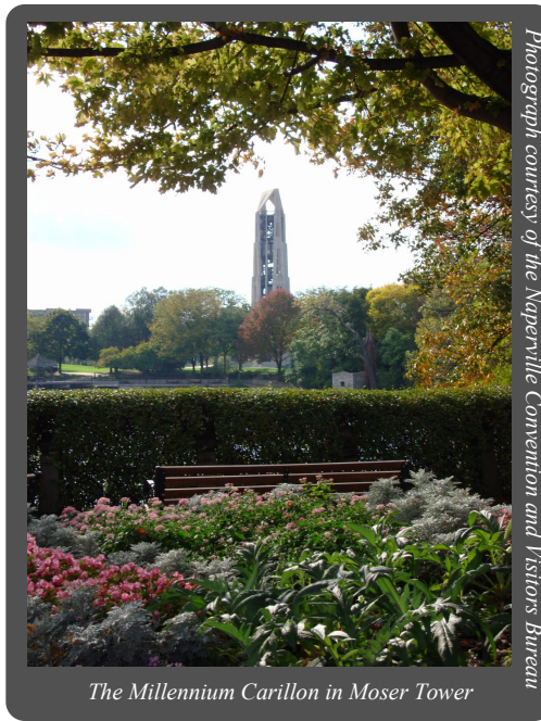
The Millennium Carillon in Moser Tower

Meetings and program sessions on Thursday afternoon and Saturday morning will be held at the Country Inn & Suites. Friday's sessions will be held across the street at Northern Illinois University's state-of-the-art conference center. For lunch and