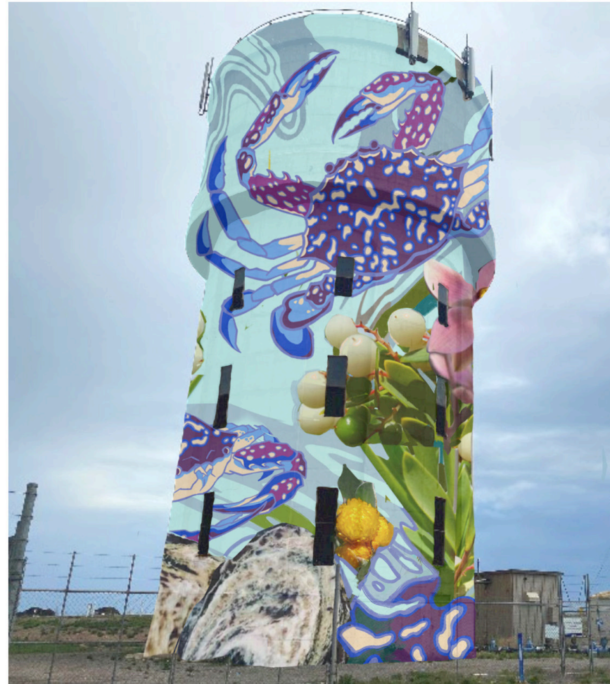
PROPOSED DESIGN- STANSBURY WATER TOWER Design placed on site.