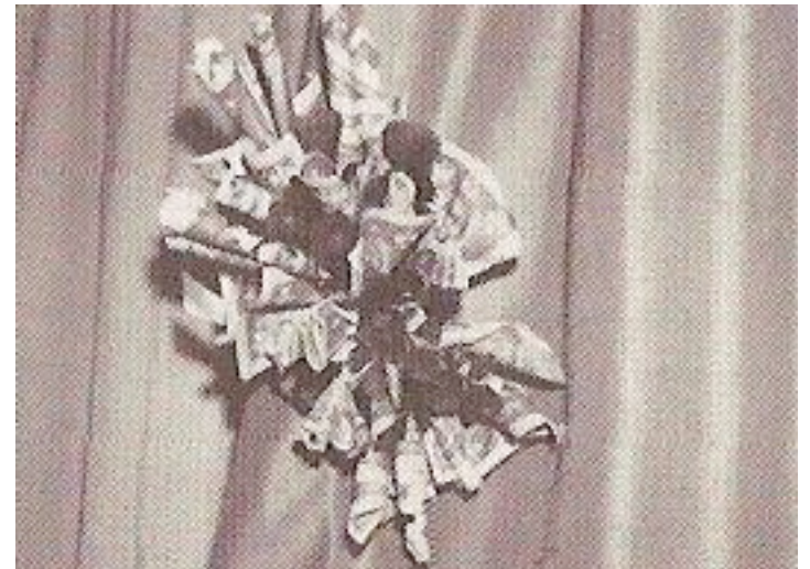
Early Green Corsage