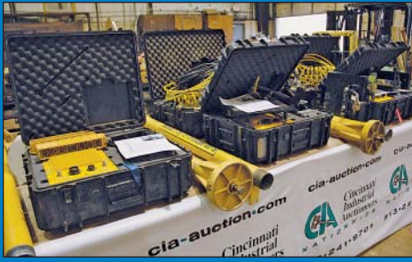
(6) Trimble GPS Systems