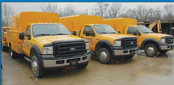
Huge Fleet Of Service, Pick-Up, Maintenance, Flat Bed and Other Trucks Of All Types

Featuring: (2) Cat Scrapers, (2) Crawler Dozers, (2) Backhoe Loaders, Front End Loader, Mini Excavator, Farm Tractors, (9) Compactors, Morbark Chipper, Road Equipment, Bobcat, Huge Quantity Attachments of All Types, Construction Tools, Supplies & Material, Truck Mount Jet Engine Dryer, (3) Flat Beds, (6) Road Tractors, Lube Truck, (19) Pick-Ups, (17) Service Trucks, (4) Dump Trucks, (3) Water Trucks, (3) Crane Trucks, Bucket Truck, (4) Passenger Vehicles, (8) Civilian Pick-Ups, (3) Detachable Neck Trailers, (16) Other Trailers, Earth Moving GPS Systems, Huge Quantity Survey Equipment, Lift Trucks, Tools, Shop & Office Equipment