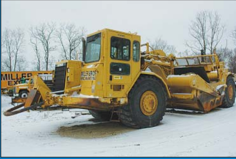
(2) 2000 Caterpillar Model 627F Tractor Scrapers