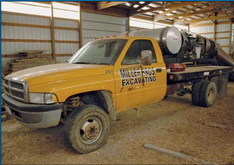
Westinghouse Model J34WE34A Gasoline Powered Jet Engine Dryer