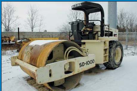
2002 Ingersoll Rand Model SD-100D Vibratory Compactor