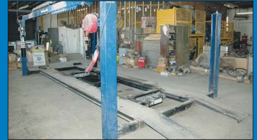
9 Ton Challenger Model AB-1346 Auto Lift