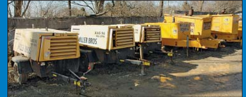
Air Compressors and Generator Systems

Tadiran Telecom Business System Phone System; Ringer Power Supply RPS, Peripheral Power Supply PPS, (2) Proctor 4 Line Loop Adaptor, Proctor OPX Long Loop Adapter, Best Power Supply, (20) Premier Phones