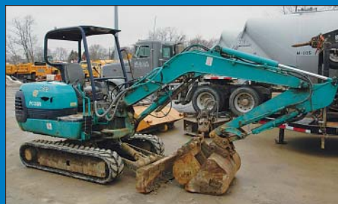
2001 Komatsu Model PC35R-8 Mini Excavator