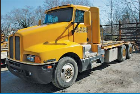
1991 and 1989 Kenworth T600 Flat Bed Equipment Hauling Trucks