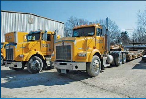
(5) Road Tractors By Kenworth and Peterbilt