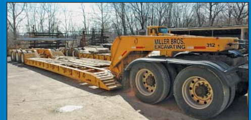
1998 - 43' Witzco Challenger Model RG-35 Detachable Gooseneck Trailer