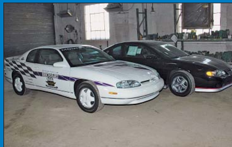
(2) Monte Carlo Nascar Edition Collector Cars