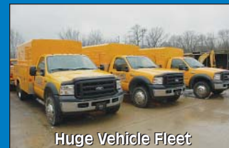
Huge Vehicle Fleet