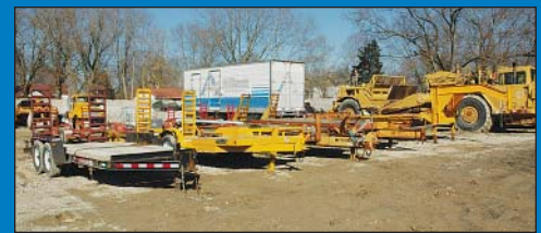
Partial View Various Equipment and Utility Trailers