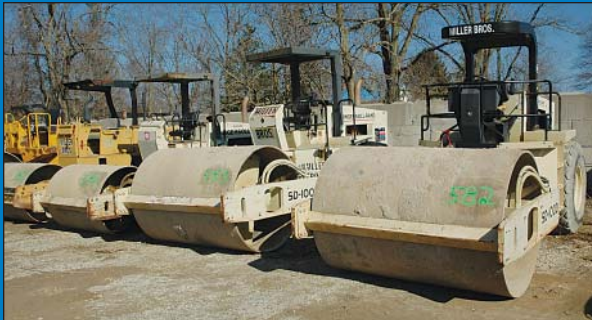
Partial View Ingersoll Rand and Caterpillar Compactors