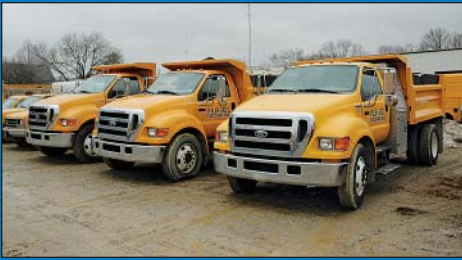
(3) 2006-2005 Ford F-650 XL Dump Trucks