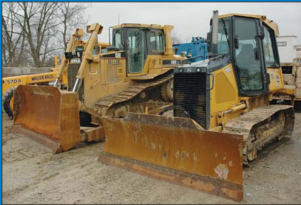
2000 Caterpillar D6RXL and 2005 John Deere 550J Crawler Dozers