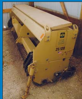
Land Pride Model 25-20 Solid Stand Grass Seeder