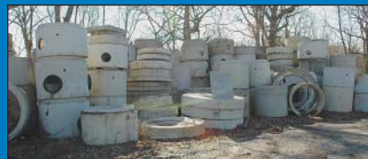
Huge Quantity Construction Materials