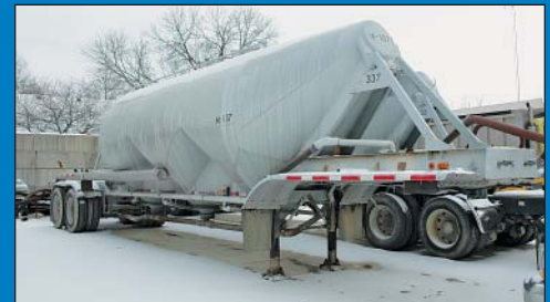
(2) 1050 Cu. Ft. Fruehauf Three-Compartment Dry Concrete Lime Transport Trailers