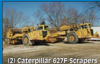
(2) Caterpillar 627F Scrapers

2020 DUNLAP ST., CINCINNATI, OHIO 45214 PHONE (513) 241-9701 / FAX (513) 241-6760 INTERNET: cia-auction.com