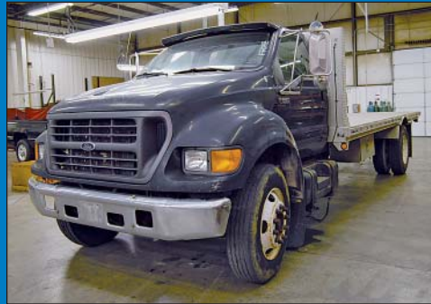
2001 Ford F-650XLT Flat Bed Truck