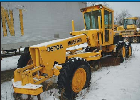
1974 John Deere Model 570A Road Grader