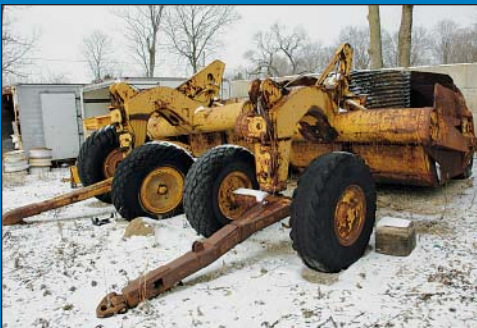
(3) Caterpillar Cable Type Pull-Behind Scrapers