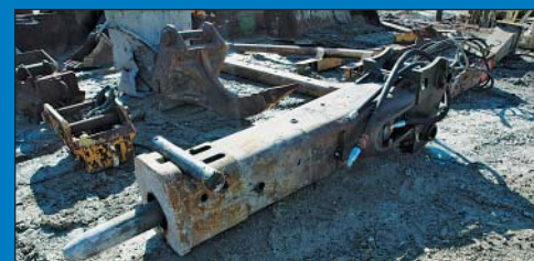
Allied Model 795CS Hydraulic Hammer Excavator Attachment