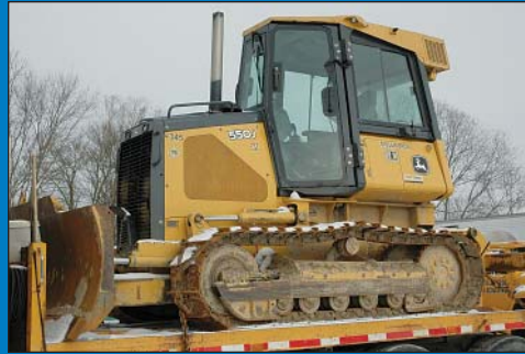
2005 John Deere Model 550J Track Type Dozer