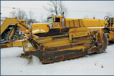
16' Wide Reynolds Model LS-16 Pull-Behind Hydraulic Scraper