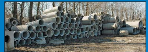
Huge Construction Material Inventory