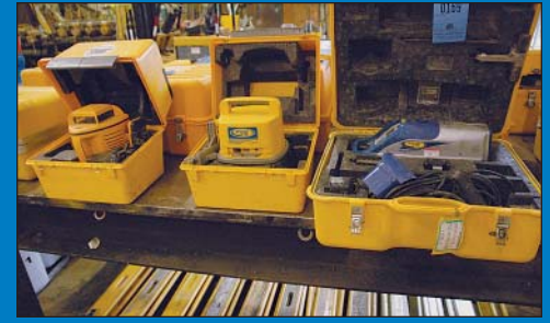
Huge Quantity Survey Equipment