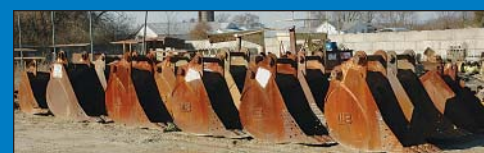
(50) Werk Brau Excavator Buckets In Sizes From 18" to 48" Wide