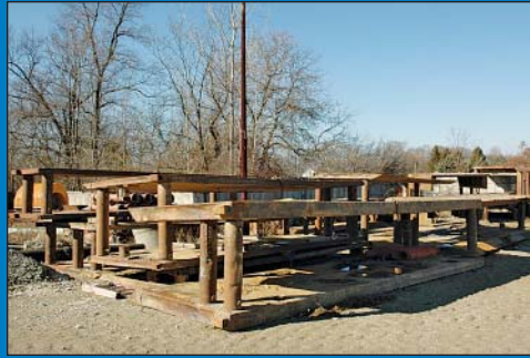
(15) Assembled Trench Boxes In Sizes To 24' X 8' X 7'