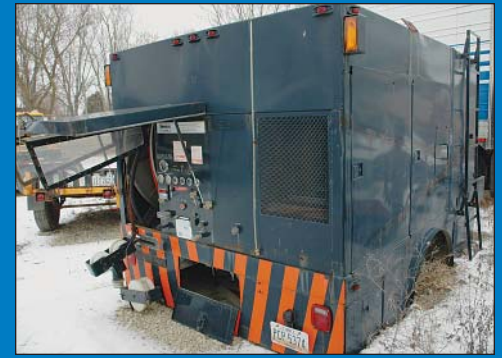
Sreco-Flexible Model HV2000TM Hy-Velocity Truck Mounted Water Jet Flushing System