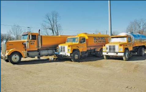
(3) Water Trucks By Kenworth and Ford