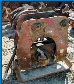
Allied Excavator Tamper Attachment