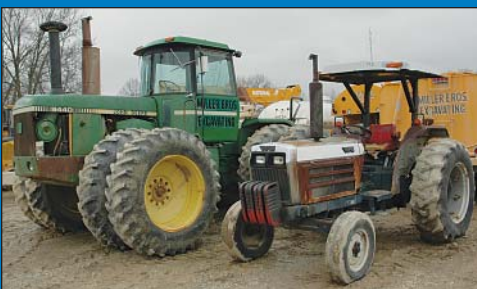
John Deere 8440 and White T700 Farm Tractors