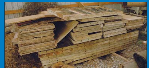
Huge Quantity Concrete Forms