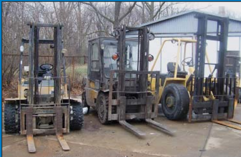
(7) Lift Trucks Of All Types