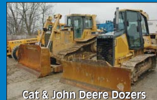
Cat & John Deere Dozers