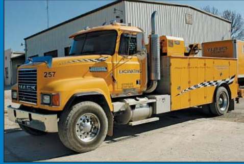
2002 Mack Model CH 602 Maintenance Truck