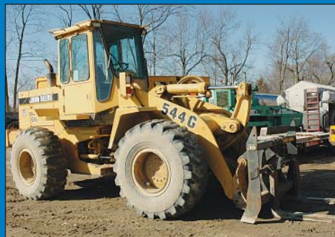
1994 John Deere Model 544G Four-Wheel Drive Rubber Tire Front End Loader