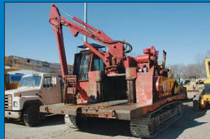
1998 Morbark Model 30/30 Mountain Goat Track Type Whole Tree Wood Chipper

Also Features: Upcoming Sale Information, Printable Color Brochures, Printable Lot Listing Catalogs, Downloadable Forms, Complete Terms of Sale