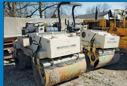
(2) 1998 Ingersoll Rand Model CR-32 Vibratory Comparators

1995 Monte Carlo Z-34 1994 Inaugural Brickyard 400 Official Pace Car Edition; V/N 2Q1WX12X8S9120507, 680 Miles, 3.4 Liter DOHC V6 Gasoline Engine, Automatic Transmission, Leather Embroidered Seats