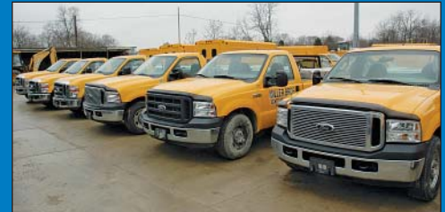
(13) 2008-2003 Ford F-250 Super Duty XL Pick-Ups with Tool Boxes and Fuel Tanks