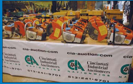
Huge Quantity Contractors Tools