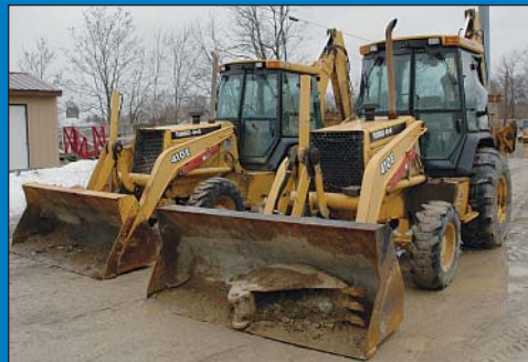
(2) 1999 John Deere Model 410E Turbo 4 X 4 Four-Wheel Drive Rubber Tire Backhoe Loaders