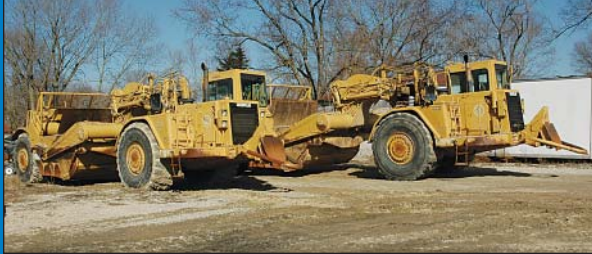
(2) 2000 Caterpillar Model 627F Tractor Scrapers