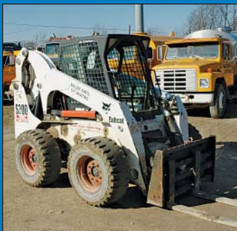
2003 Bobcat Model S300 Skid Steer Loader