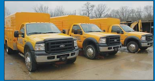
(5) 2006-2004 Ford F-550 Super Duty XL Walk In Utility Bed Service Trucks