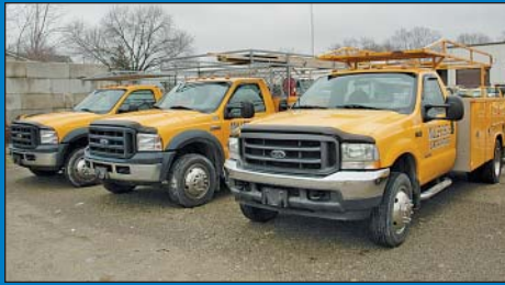
(3) 2006-2003 Ford F-350 Utility Bed Service Trucks