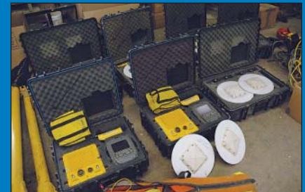
Huge Quantity Contractor Tools and Equipment