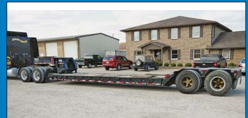
2000 - 51' Talbert Model T (4) DW-55SA-1-TI (EC 3/1)-60 Triple Axle Detachable Neck Trailer