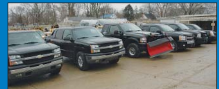
Partial View Civilian Vehicle Fleet