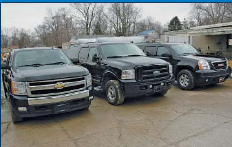
Partial View Passenger Vehicles