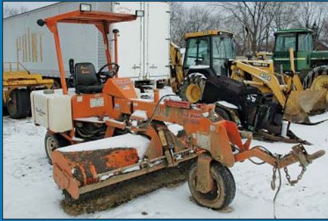
2004 Broce Model BB-250-B Rider Type Power Broom