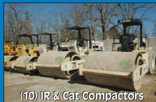
(10) IR & Cat Compactors