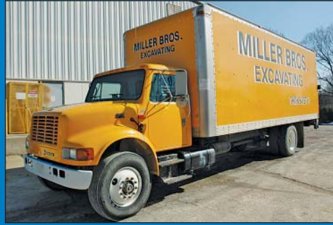
1997 International Model 4900 DT 466E Van Body Lube Truck