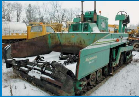
10' Wide Barber Greene Model Matmaker SA-150 Asphalt Paver