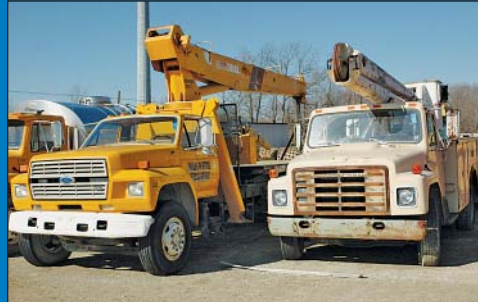
Ford Crane Truck and International Bucket Truck