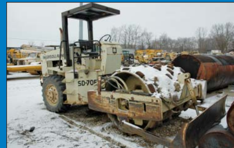
1989 Ingersoll Rand Model SD-70F Vibratory Sheepsfoot Compactor