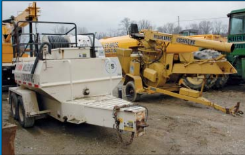
Finn T-90-TD and MSW-27 Seeding Machines