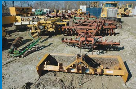
Partial View Pull Behind Attachments