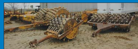
Partial View Pull Behind Sheepsfoot Compactors