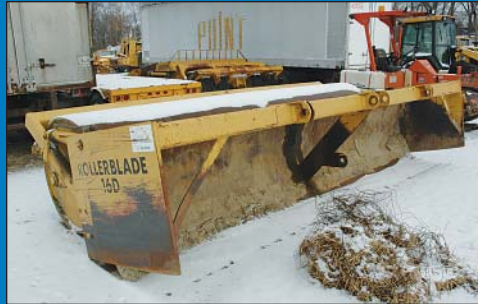
Holmes Model Rollerblade 16D Pull Behind Scraper/Compactor