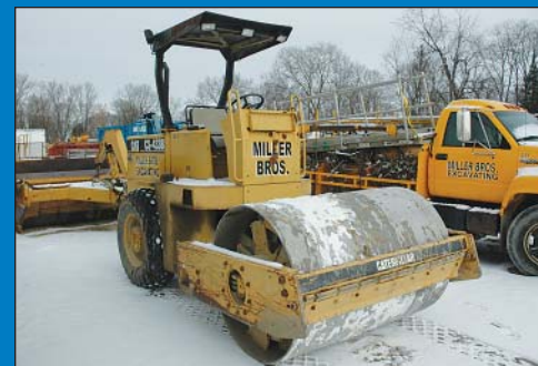
1992 Caterpillar Model CP-433B/CS-433B Vibratory Compactor