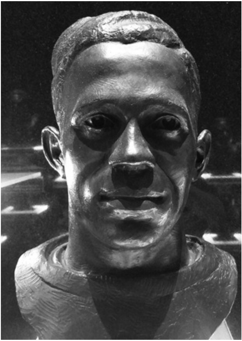
Fritz Pollard one of the first Black players in the NFL who also was a coach.