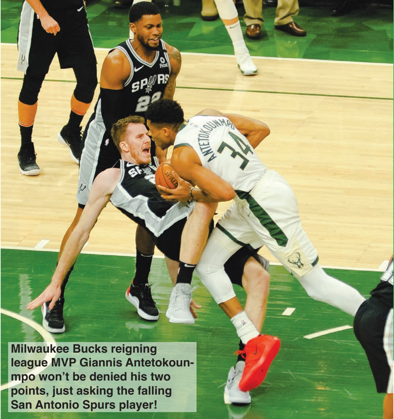
Milwaukee Bucks reigning league MVP Giannis Antetokounmpo won't be denied his two points, just asking the falling San Antonio Spurs player!

VOL. XXXVIII NO.43 JAN. 10, 2020 50 CENTS BULK RATE U.S. POSTAGE MILWAUKEE, WISCONSIN PERMIT 4668