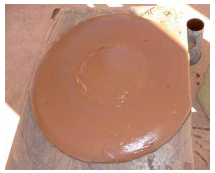
Fill with admixture

BASF can control and achieve these requirements by implementing the following chemical processes with its