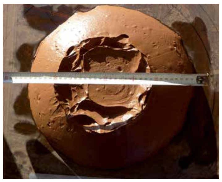
Fill without admixture