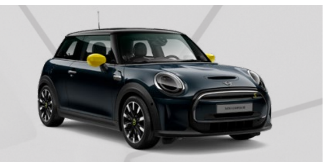
Image shows the new MINI Electric Level 2 personalised with black roof and mirror caps (no additional costs).