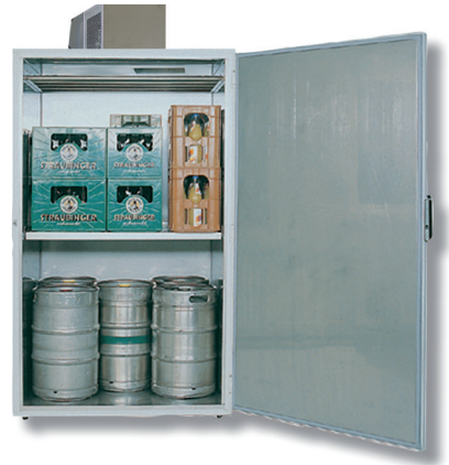
Big Volume Refrigerators