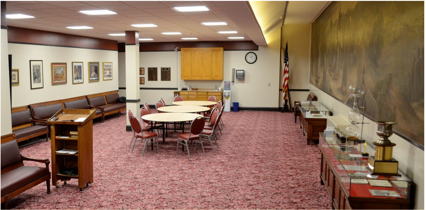
The education room of Minneapolis Valley.