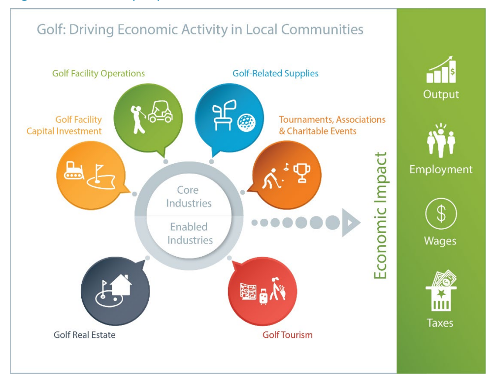
Figure 2 Golf Industry Impact Framework

For the past 15 years, the World Golf Foundation's GOLF 20/20 and key golf industry stakeholders in many states have successfully measured and communicated golf's economic impact—i.e., how much the game contributes to state and national economies through direct, indirect, and induced economic activity and employment. As a result, the framework has been replicated internationally—e.g., see Ernst & Young's The Australian Golf Industry Economic Report 2010 and Sports Marketing Survey Inc.'s The Economic Impact of Golf on the Economy of England 2012.3 Adoption of the WGF's golf industry impact framework4 has enabled the golf industry to assess its overall growth and the growth of individual industry segments over time and across geographic regions. Figure 1 presents the WGF's golf industry and economic impact framework.