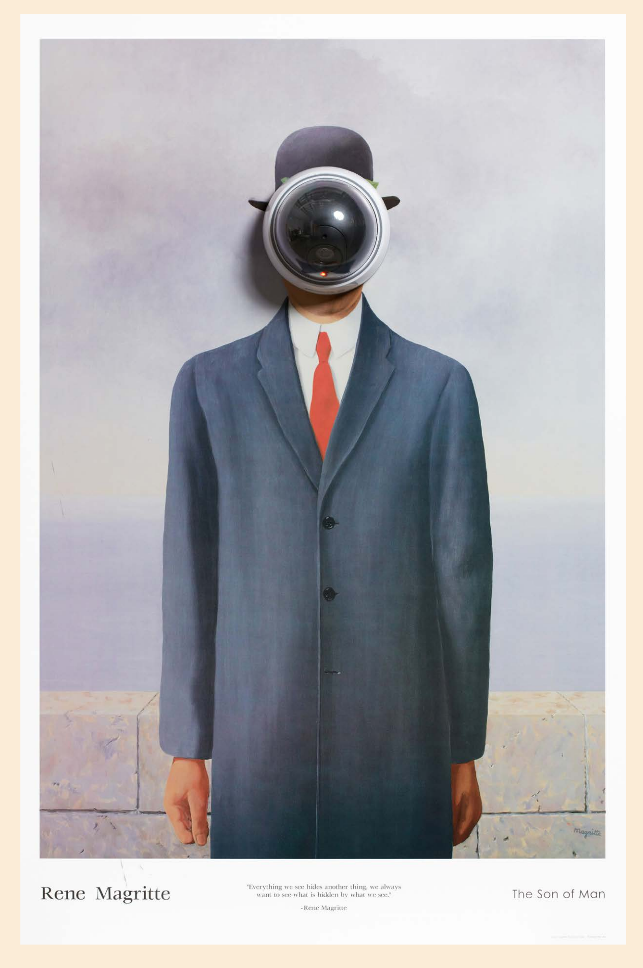
Security on The Son of Man (after Magritte), 2014, from Security series, found poster with security camera, 91.5 x 61 cm © Miriam Stannage