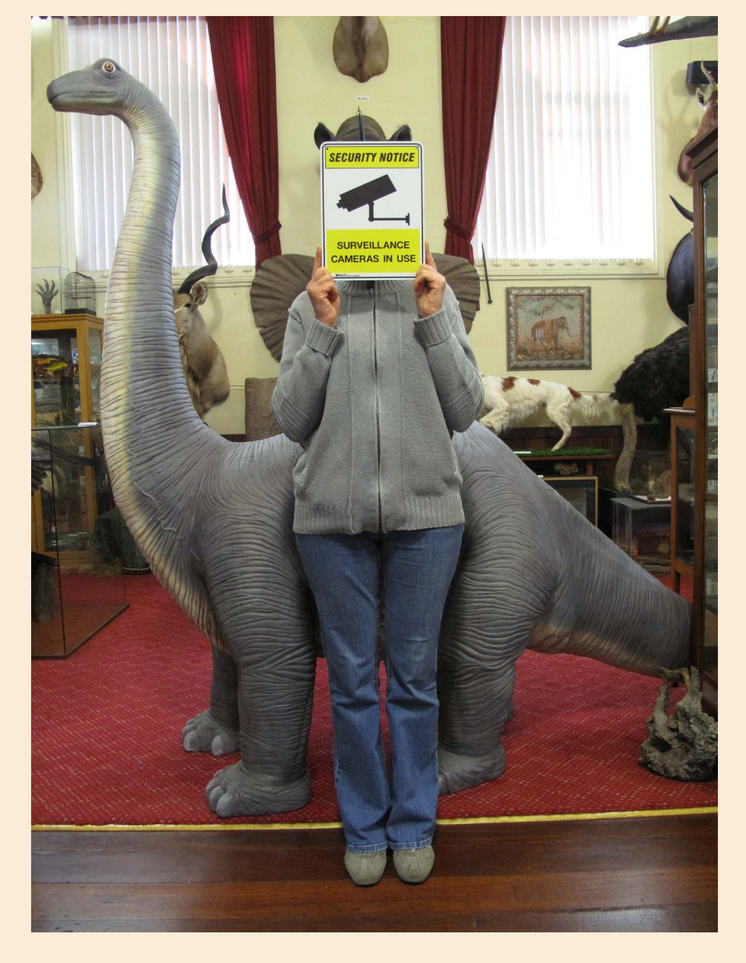
Museum of Natural History, 2015, from Security Notice series, lightjet photograph, 100 x 70 cm © Miriam Stannage

100 Popular Pictures: Facsimile Reproductions in Colour of Popular Pictures Selected from the World's Great Galleries with an introduction by M.H. Spielmann and notes by Arthur Fish (2 volumes), Cassel and Company Limited, London, 1911.