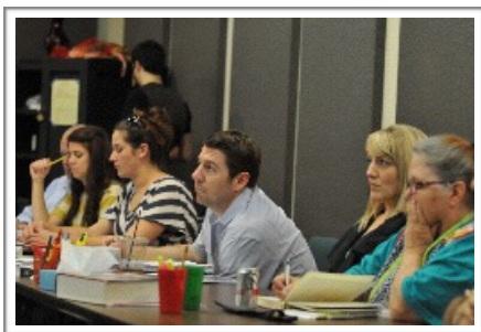
Creative Team of The Merry Wives of Windsor

The Shop and Stage Crew builds the set, props and costumes according to the designer's plans. The Stage Crew sets the stage with props and furniture, assists the actors with costume changes and operates sound, lighting and stage machinery during each performance.