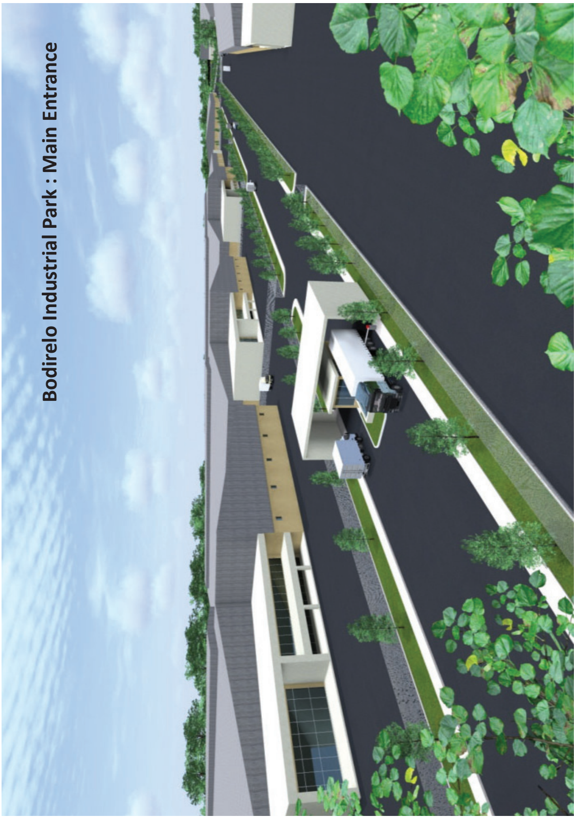
Bodirelo Industrial Park : Main Entrance