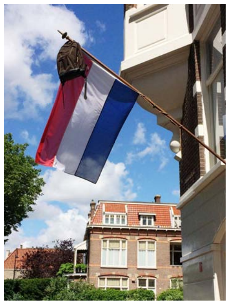
Celebrating successful exams in Dordrecht, The Netherlands, in June.

When a member of the Royal House (House of Orange) has a birthday an orange pennant is flown above the flag. This occurs only on land, never at sea.