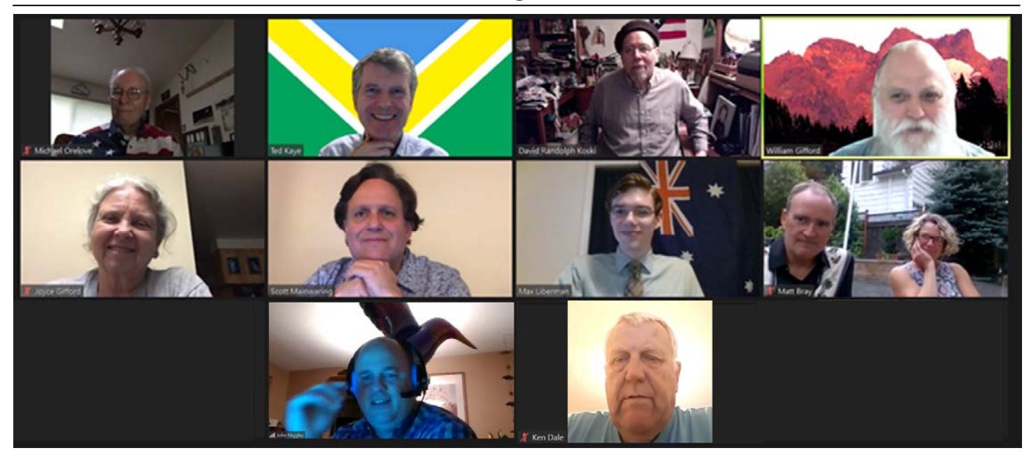
The participants in the meeting enjoy the company of like-minded vexos.