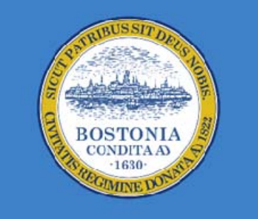
Boston, Massachusetts, USA