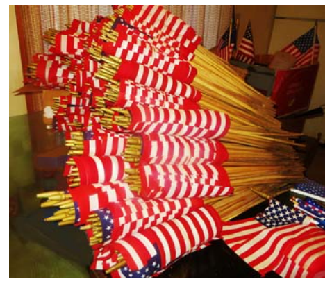
Some of the 4,000 flags that have been cleaned and ironed.

This year, however, he has taken on a herculean task—reconditionin all 4,000 flags that decorate the graves of veterans at Lincoln