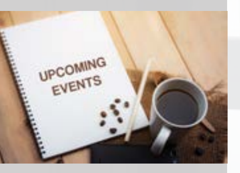
Save the Date: Tuesday, March 19, 2019 Our Annual Friend-Raising Luncheon

All events are emailed to our subscribers, posted on Facebook and Eventbrite. Please follow us!!