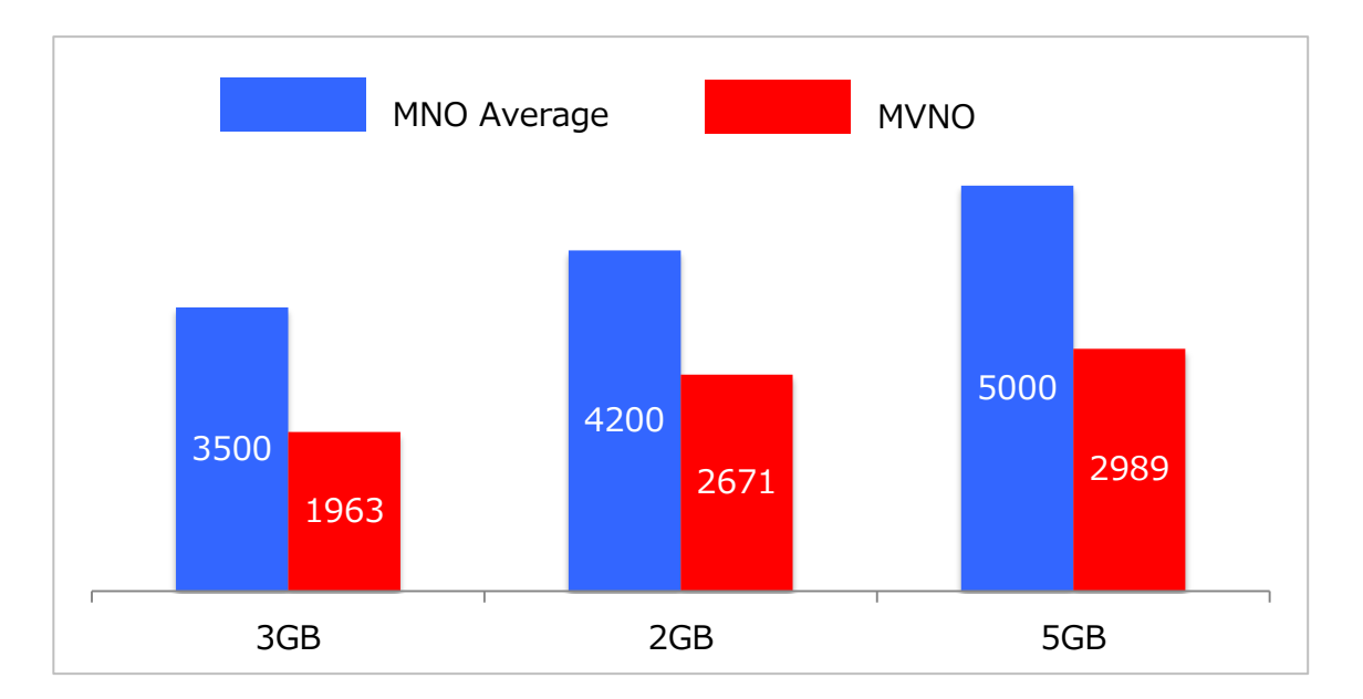
Figure 2: Average Monthly Data Prices of MNOs and MVNOs November 2014 (original data by operators)

Recently, Mobile Virtual Network Operators (MVNOs) have been introducing reasonably-priced plans. Japan has been relatively slow in MNVO take-up compared to European countries. In fact, Japan Communications, the first Japanese MVNO in the market, launched its PHS-based service in 2001 and its cellular-based service in 2008. However, it has only been in the last 12 months that a number of MVNOs have made impactful offers within the market. The graph below compares the average monthly data prices of SIM plans (with pay-as-you-go voice options) by five popular MVNOs with the data prices of typical contract plans by major mobile operators (MNOs) in Japan.