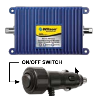
IMPORTANT: Do not power up the Signal Booster unless antenna cables are attached to Signal Booster.

Connect the power cable from the DC plug-in power supply to the Signal Booster marked "6 V DC" and insert the large end into DC power socket (the vehicle power adapter outlet).