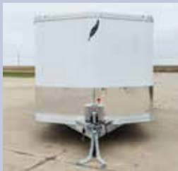
Bumper pull aerodyne nose