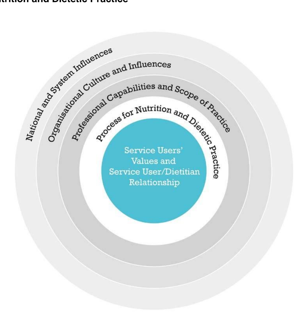
Figure 2 Model of Nutrition and Dietetic Practice