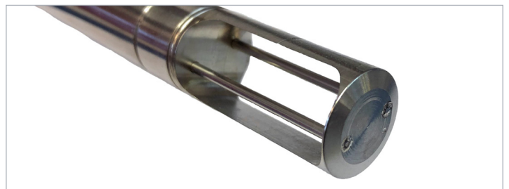
The Fox Thermal DDC-Sensor™ eliminates sensor element vibration which can lead to metal fatigue and failure.

If the CAL-V™ test is performed using the FT4X View™ software, a Calibration Validation Certificate can be produced at the conclusion of the test. The certificate will show the date and time of the test along with meter data such as meter serial number, configuration settings, and currently selected gas/ gas mix. This in-situ calibration validation test helps operators comply with environmental mandates and eliminates the cost and inconvenience of annual factory calibration. View historical CAL-V™ test data in the log.