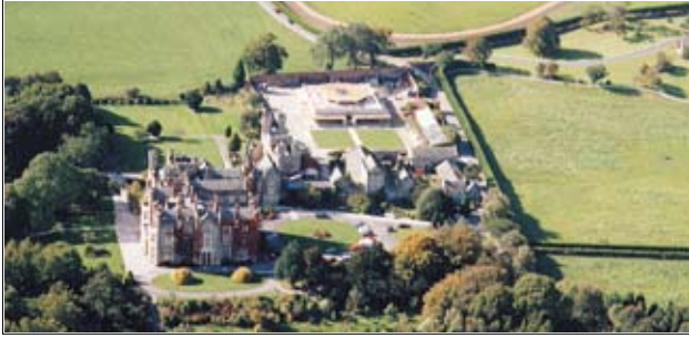
Manjushri Kadampa Meditation Centre, England

programme for at least one year. After that they may return, but thereafter cannot become an NKT Dharma Teacher. This rule has been adopted only to protect the purity of holy Dharma, to prevent ordination from being broken in the future, and to save people's faith.