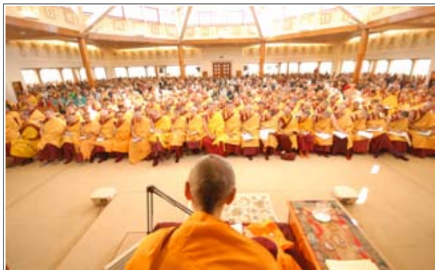
The Temple at NKT-IKBU International Festivals at Manjushri KMC, England

Every year at the NKT-IKBU International Spring and Summer Festivals at Manjushri KMC in the UK, people gather together from around the world to attend teachings and meditation sessions. There are also Festivals and Dharma Celebrations in many other countries around the world. These events are regarded