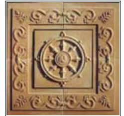
Benefit others by turning the Wheel of Dharma

According to the 2007 edition of the NKT-IKBU Directory of Kadampa Buddhist Centres and Branches there are about 1,100 main NKT Centres and branches worldwide. In the UK there are presently 47 Dharma Centres, all of which are registered charities, and about 320 branches of these Centres. All NKT Centres are listed in the NKT-IKBU Directory , which is updated each year. A database of Centres is also maintained on the NKT-IKBU website.