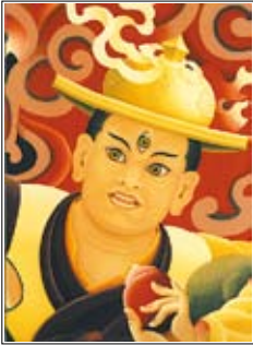
The Dharma Protector Dorje Shugden, a manifestation of the Wisdom Buddha