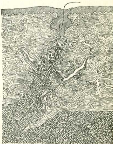
Fig. 502.—Columna adiposa (Warren).

The local symptoms in the beginning resemble those of a boil, but the constitution sympathizes from the very start (a chill and a septic fever) and the pain is usually severe. The inflammatory area begins as a papule with an indurated base, it enlarges enormously, is boggy to the touch, is dusky in color, is edematous, and the skin is not freely movable over the deeper parts. In a few days many pustules appear, each pustule marking the site of a focus of necrosis. Large vesicles filled with bloody serum very frequently form. In some cases, about the tenth day, the pustules rupture, the necrotic plugs are discharged, and the case slowly progresses toward cure; but in many cases the carbuncle spreads at the periphery while pustules are rupturing near the center of inflammation, and pus forms in the deeper tissues, reaching the surface through many small openings, each of which is partly blocked by a plug of dead tissue. A carbuncle in this stage resembles a honeycomb (Fig. 504), discharges bloody pus, and large masses of skin and subcutaneous tissue are destroyed. The entire carbuncular mass may become gangrenous,