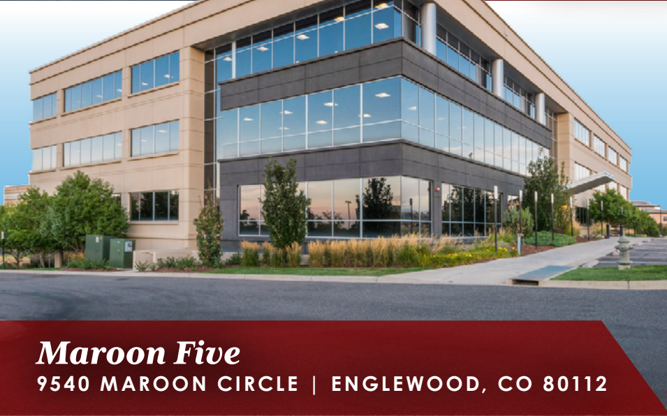
Maroon Five 9540 MAROON CIRCLE | ENGLEWOOD, CO 80112