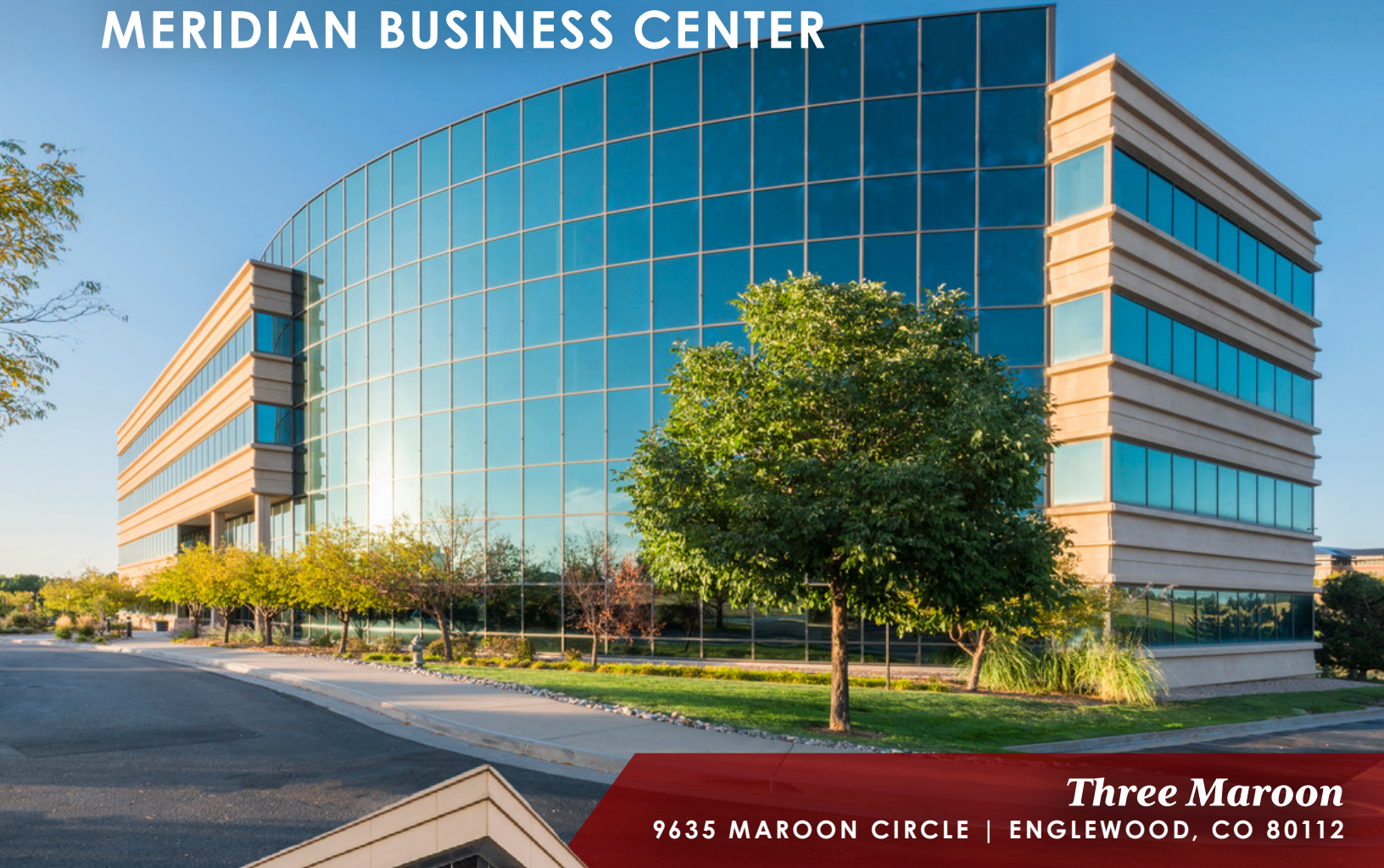
Three Maroon 9635 MAROON CIRCLE | ENGLEWOOD, CO 80112