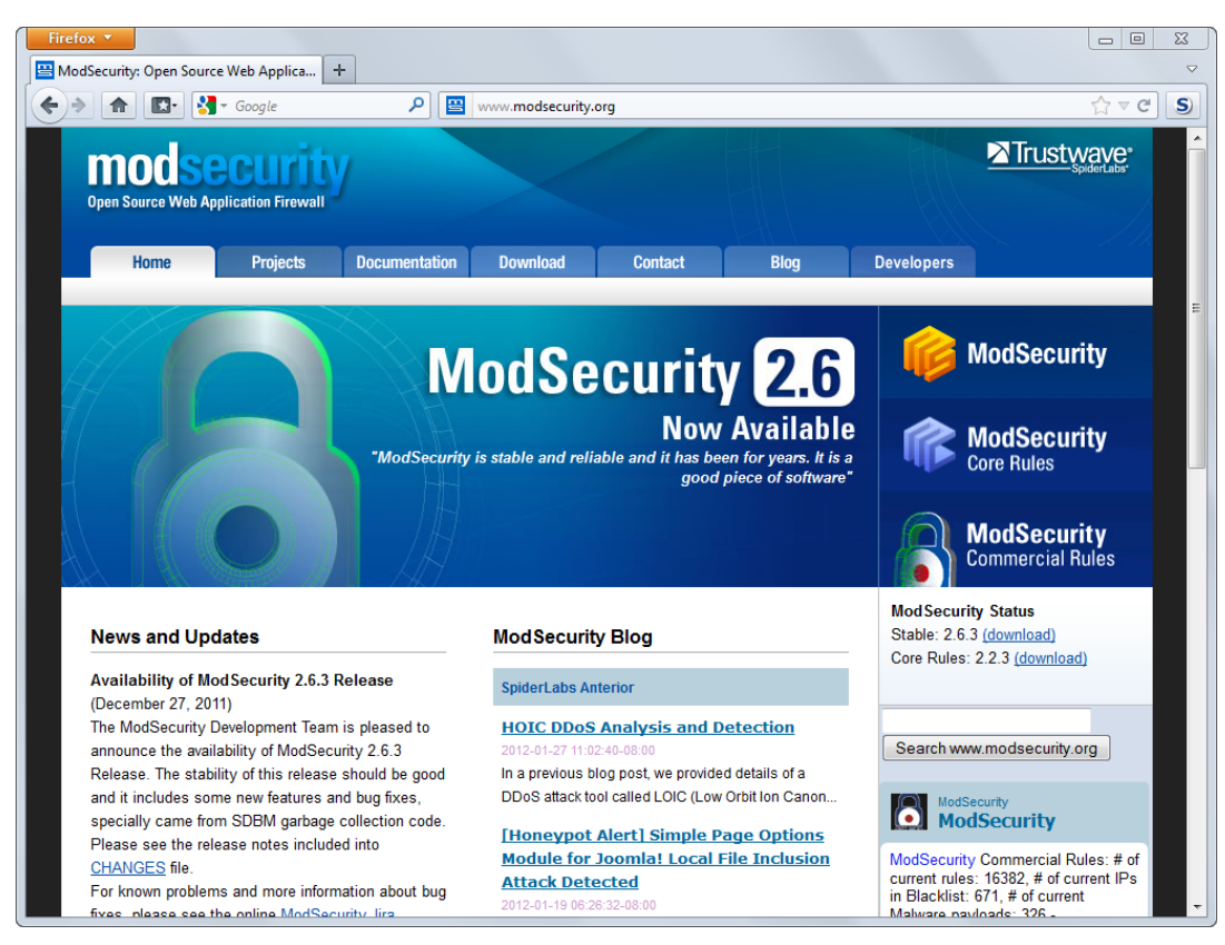
Figure 2-1. The homepage of www.modsecurity.org