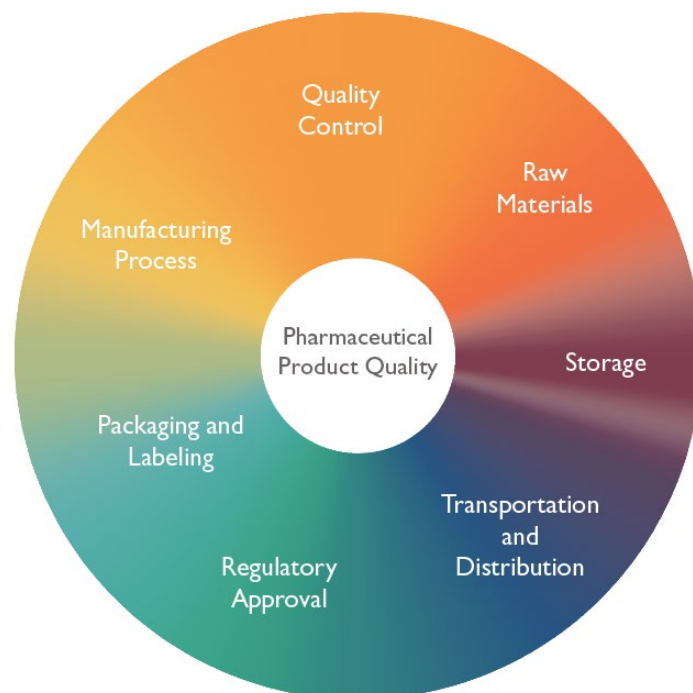
Figure 1: Determinants of pharmaceutical product quality in the supply chain

Quality assurance (QA) is a wide-ranging concept covering all matters that individually or collectively influence the quality of a product. It is the totality of the arrangements made with the objective of ensuring that pharmaceutical products are of the quality required for their intended use. Quality assurance therefore incorporates several factors and it is an integral part of all key activities in the product supply chain (Figure 1).