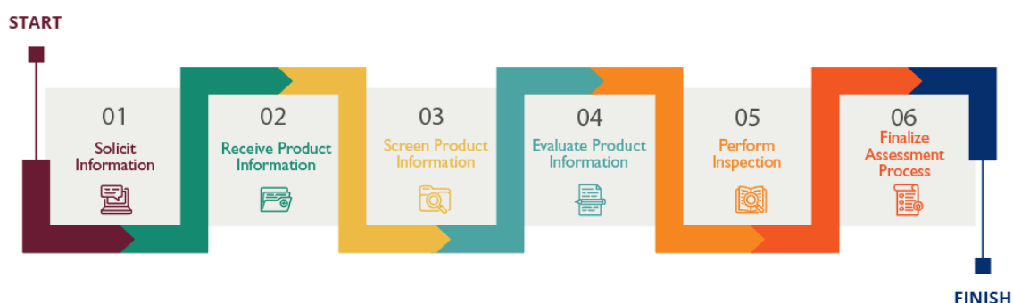
Figure 3: Prequalification process

Figure 3 summarizes the key steps in the prequalification process. The quality assurance approaches for each step in the prequalification process are described below.