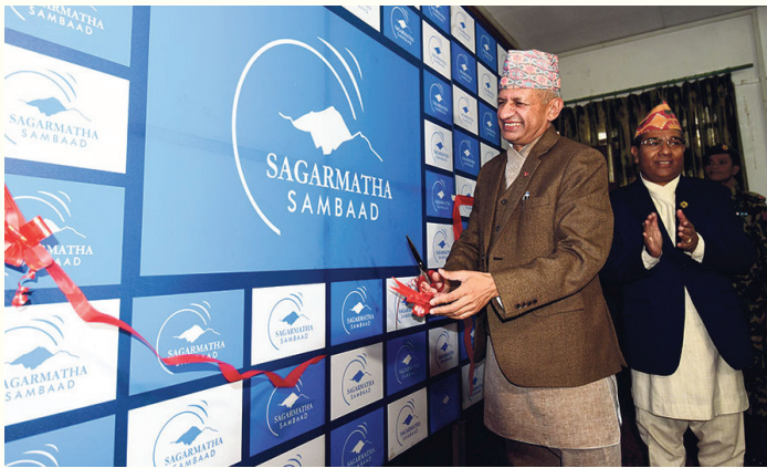
Foreign Minister Mr. Pradeep Kumar Gyawali inaugurating SAGARMATHA SAMBAAD Secretariat, Narayanhiti, Kathmandu, 21 November 2019

Foreign Minister Gyawali expressed that the main objectives of the first edition of Sagarmatha Sambaad are to forge a consensus among countries on the impending climate crisis. It also aims to encourage political leaders to mobilize their willpower to tackle the menace of climate change and create awareness among participants, stakeholders and the entire world about the direct relation that exists between the climate change and mountain ecology. Sagarmatha Sambaad, which will be held every two years, will be jointly organized by the Ministry of Foreign Affairs, Institute of Foreign Affairs (IFA) and Policy Research Institute (PRI).