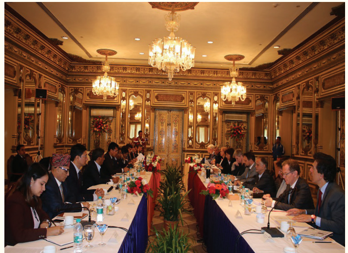
11th Meeting of Nepal-EU Joint Commission, Kathmandu, 8 November 2019