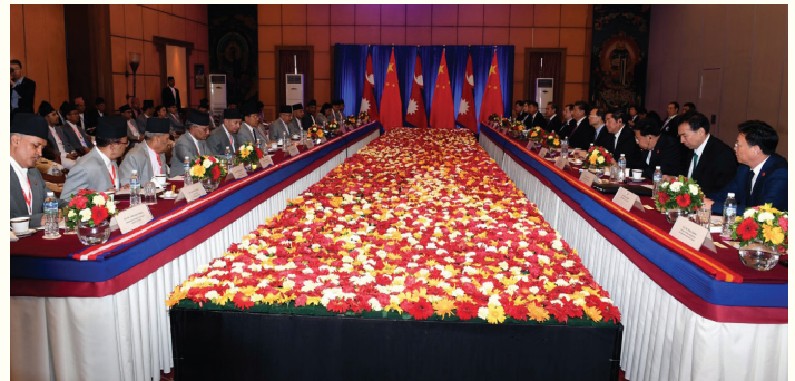
Delegation level bilateral talks between President of China Mr. Xi Jinping and Prime Minister Mr. K P Sharma Oli, Kathmandu, 13 October 2019

President Mr. Xi Jinping and Prime Minister K P Sharma Oli held delegation level official talks on 13 October, the second day of the visit. In the meeting, both the leaders exchanged views on further consolidating multi-dimensional relationship between Nepal and China. After comprehensive discussions on substantive matters of bilateral and multilateral fronts at the delegation level talks, the two sides issued a fourteen-point Joint Statement which reflects present state of Nepal-China relations and guides the bilateral cooperation for the days to come.