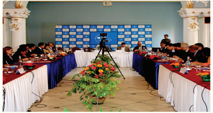
Foreign Minister Mr. Pradeep Kumar Gyawali briefing about the Sagarmatha Sambaad to the Diplomatic and International Community, Kathmandu, 21 November 2019

The Ministry of Foreign Affairs organized on 21 November a briefing programme to the Kathmandu-based Heads of Diplomatic Missions, Diplomatic Corps and Representatives of Regional and International Organizations about the establishment of the Sagarmatha Sambaad and its first edition. The inaugural episode of the Sambaad is scheduled to be held in Kathmandu from April 2 to 4, 2020 on the theme “Climate Change, Mountains and the Future of Humanity”.