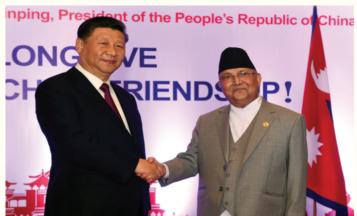
Prime Minister Mr. K P Sharma Oli with Chinese President Mr. Xi Jinping after witnessing the signing and exchange of bilateral documents, Kathmandu, 13 October 2019

Following the official talks, the President and Prime Minister witnessed the signing and exchange of twenty bilateral documents- Treaty, Agreements, MoUs, and Letters of Exchange.