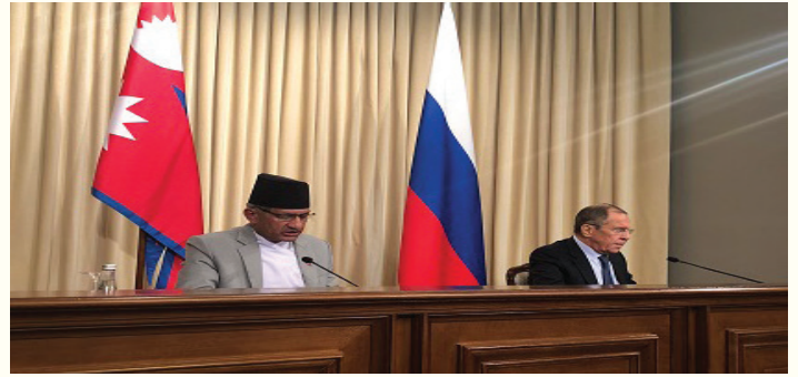
Foreign Minister Mr. Pradeep Kumar Gyawali and Russian Foreign Minister Mr. Sergey Lavrov jointly addressing the Press after Delegation Level Talks, Moscow, 25 November 2019

Minister for Foreign Affairs Mr. Pradeep Kumar Gyawali paid an official visit to the Russian Federation from 24-27 November and held a meeting with the Foreign Minister Mr. Sergey Lavrov on 25 November. The two Foreign Ministers exchanged views on various aspects of bilateral relations and underscored the importance of the exchange of high-level visits and agreed to enhance bilateral cooperation in trade and investment. They also discussed ways for promoting tourism and people-to-people contacts. The two sides also shared views on fostering partnership and cooperation in regional and multilateral forums on the issues of common concerns.