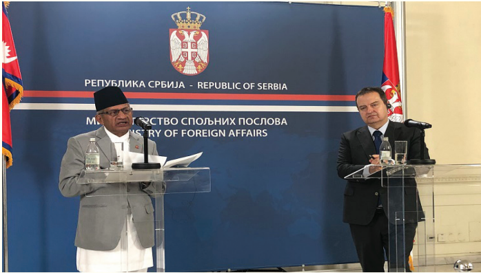
Foreign Ministers of Nepal and Serbia jointly addressing the Press after Delegation level Talks, Belgrade, 28 November 2019