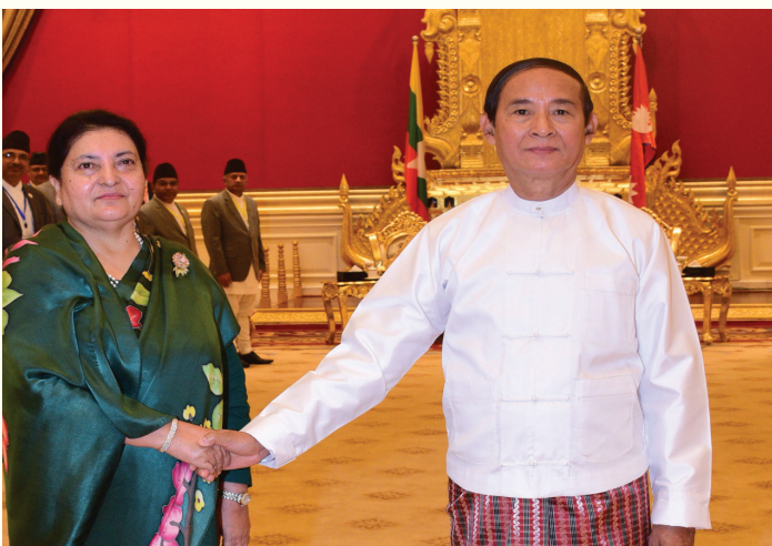
President Mrs. Bidya Devi Bhandari with President of Myanmar U Win Myint, Nay Pyi Taw, 17 October 2019

While in Myanmar, the President visited places of historical and cultural importance, including Yangon, the old capital, and Bagan, a UNESCO world heritage site. The President also visited Pyin Oo Lyin and interacted with the citizen of Myanmar of Nepali origin.