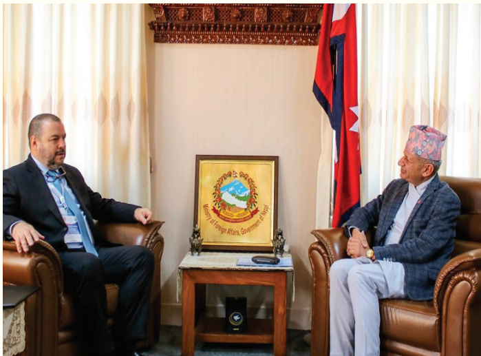
Chairperson of GANHRI Dr. Carlos Alfonso Negret Mosquera with Foreign Minister Mr. Pradeep Kumar Gyawali, 14 October 2019

to promoting cooperation between the Government of Nepal, National Human Rights Commission and GANHRI were discussed.