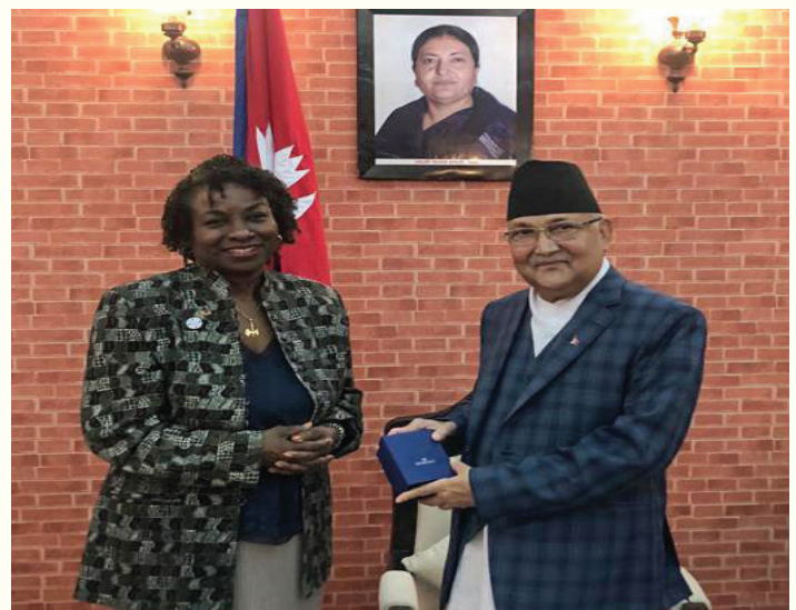
UNFPA Executive Director Dr. Natalia Kanem with Prime Minister Mr. K P Sharma Oli, Kathmandu, 21 October 2019

The Executive Director of UNFPA Dr. Natalia Kanem visited Nepal from 20 to 22 October to extend an invitation for Nepal's participation in the Nairobi Summit on International Conference on Population and Development (ICPD 25). During her visit, she paid courtesy call on Prime Minister Mr. K P Sharma Oli on 21 October at his residence. She also paid calls on Deputy Prime Minister and Minister for Health and Population Mr. Upendra Yadav, and Minister for Foreign Affairs Mr. Pradeep Kumar Gyawali, separately. During these meetings, matters related to enhancing cooperation between Nepal and UNFPA along with Nepal's participation in the ICPD 25 were discussed.