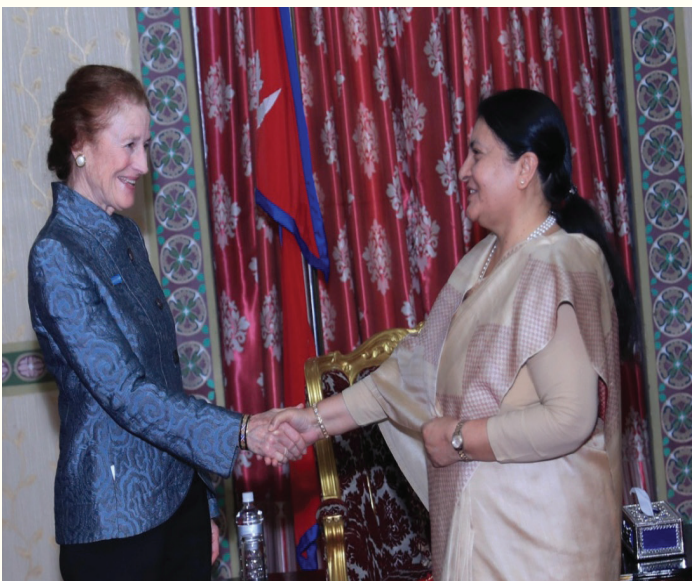
Executive Director of UNICEF Ms. Henrietta H. Fore paying courtesy call on President Mrs. Bidya Devi Bhandari Kathmandu, 4 November 2019

Under Secretary General and Executive Director of UNICEF Ms. Henrietta H. Fore visited Nepal to participate at the Scaling-up Nutrition (SUN) Global