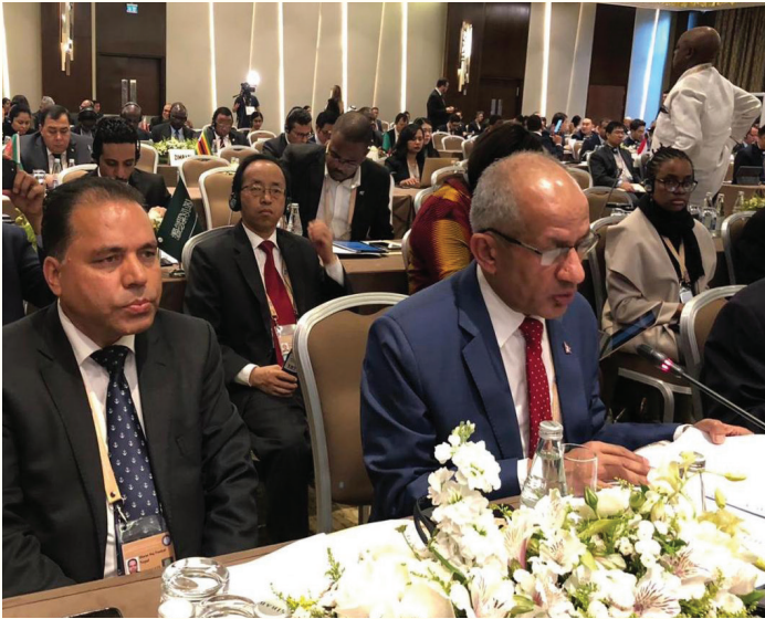
Foreign Minister Mr. Pradeep Kumar Gyawali delivering a statement during the Preparatory Ministerial Meeting of the 18th NAM Summit, Baku, 23 October 2019

resources for preventing conflicts and help member states achieve peace and stability. Minister Gyawali further added that a stronger and revitalized NAM is a sine qua non for achieving peace, development, and security and urged member countries to support each other in building domestic capacity by sharing their experiences, best practices and provisioning of resources through the South-South Cooperation. He also underlined the importance of NAM for equal rights, equal opportunities, equal protection and equal respect for all countries.