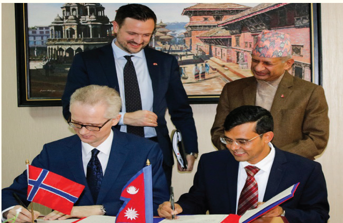
Signing Ceremony of the MoU Establishing Nepal-Norway Bilateral Consultation Mechanism, Kathmandu, 4 October 2019

The 11th meeting of the Joint Commission between Nepal and the European Union (EU) was held in Kathmandu on 8 November. A wide range of issues of mutual interest were discussed. Both delegations agreed to further strengthening the political partnership, development cooperation and promoting global and regional collaboration on matters of common interests.