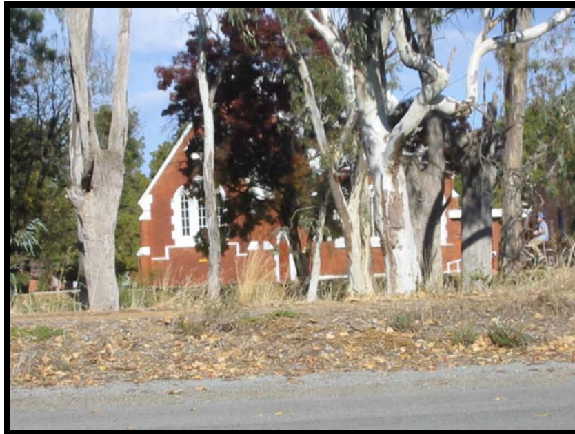
Fig 7. A typical picturesque view of the Uniting Church, as seen from within and without the precinct. This photo is looking south from the other side of the Creek, in Kostadt Heritage Precinct. Note the importance of the background of predominantly space, trees and sky around the building in creating a strong picturesque setting for the delightful Gothic architecture of this building.

The Uniting church allotment is bounded by Church Street which runs parallel to Broken Creek and from Church Street, Chapel Street and Bromley Street. It allows 360 degree picturesque views of the church within this precinct and from across the other side of Broken Creek.