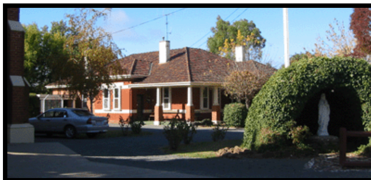
Fig 12. Catholic Presbytery and Grotto.

The original timber Presbytery was built in the early twentieth century, but after a fire, four of those rooms were incorporated into the current brick building which was constructed in 1940 by builder W Tuttle from Numurkah. 12