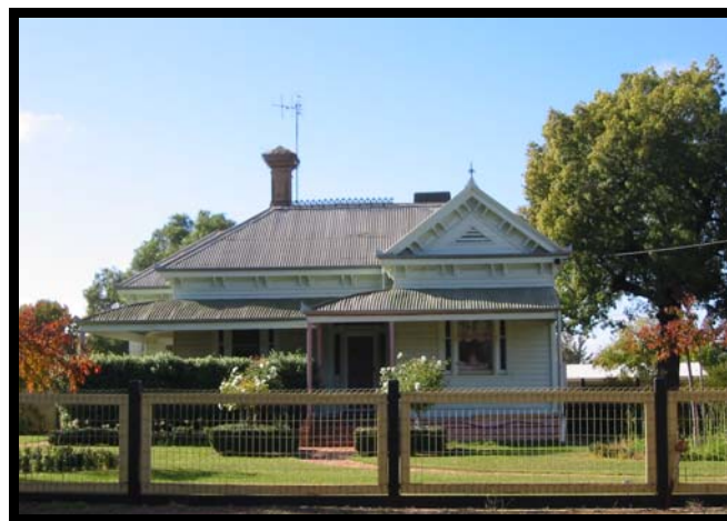
Fig. Former Wesleyan Manse, 3 Chapel Street, Nathalia. Source: Lorraine Huddle. 2004

The new building was forty three feet by twenty four feet, with four mullion windows set into either side of the high timber roof. Worshipers could enter under a rose window framed in New Zealand stone. 14 The apse has a roundel in the apex above a tripartite gothic window. A porch was added in 1910. In 1890 the old church building was used as a private school run by the Wesleyans. The timber and galvanised iron manse below is an outstanding example of an elegant transition style residence between the architecture of the Victorian era and Federation era.