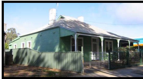
Fig 8 Bromley St. Now known as 'Carinya', this was the site of the first school and teacher's residence.

In 1882 a 'wooden school '30 x 18 x 14 feet' with an iron roof' was built, which later became a teacher's residence of much controversy for its 'meanness'. The handsome Federation style red brick building was opened in 1891, after the rolls had swelled to 149, crowded into a space designed for 50 to 60 pupils. 9 The single storey red brick school with decorative bands of light cream bricks and timber fretwork in the gable ends, was thus associated with the rapid population growth of the 1880s and early 1890s. By 1900 the population of the town was over 700 and that of the Numurkah shire of which Nathalia then formed a part was over 7000. As early as 1886 the school attendance had reached 80. The smaller 'infant's room' was renovated out of the original 1882 school building in 1908 to relieve further crowding and partitioned into four rooms, with the addition of verandahs and a portico. 10