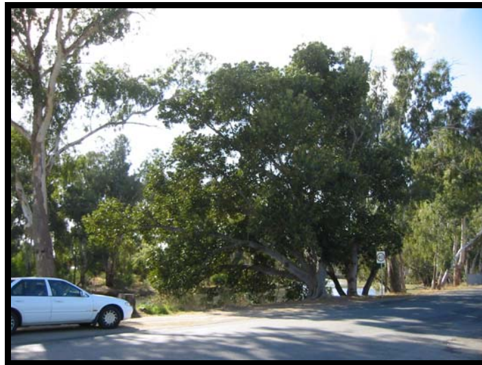
Fig 4. Important view looking east along the Broken Creek boundary of the Kurrajong Heritage Precinct. Note the large Moreton Bay Fig Tree and large number of gum trees lining the banks of the Creek and road.

The exact age of the massive Moreton Bay Fig trees and Pepper trees is not known, but the first Australian Arbour Day was held in 1890, and Moreton Bay Fig Trees were planted in many public places at that time, so they may date from that year.