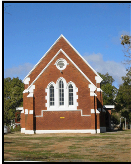
Fig. Uniting Church, Bromley Street, Nathalia. Source: Lorraine Huddle. 2004

The first Methodist services in the region were held in private homes in Nathalia until a church was erected in Nathalia and Yielima in 1878. The Nathalia church was replaced by a brick church in 1882. 13 The present church was opened in February 1890: