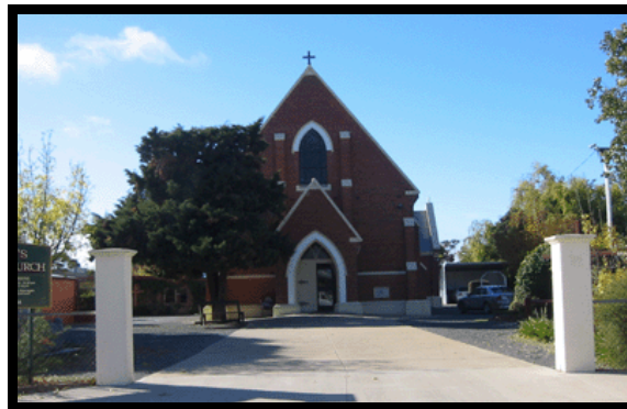
Fig 12. Catholic Church and White Granite Tombstone.

The Catholic church with notable stained glass windows, was designed in the Gothic manner with a cast iron gallery by prolific local architect Allan MacDonald, and built by contractor T A; Neild for £1211 11 The white granite tombstone is in the grounds of the church, in a similar manner to one at the Catholic Church in Cobram.