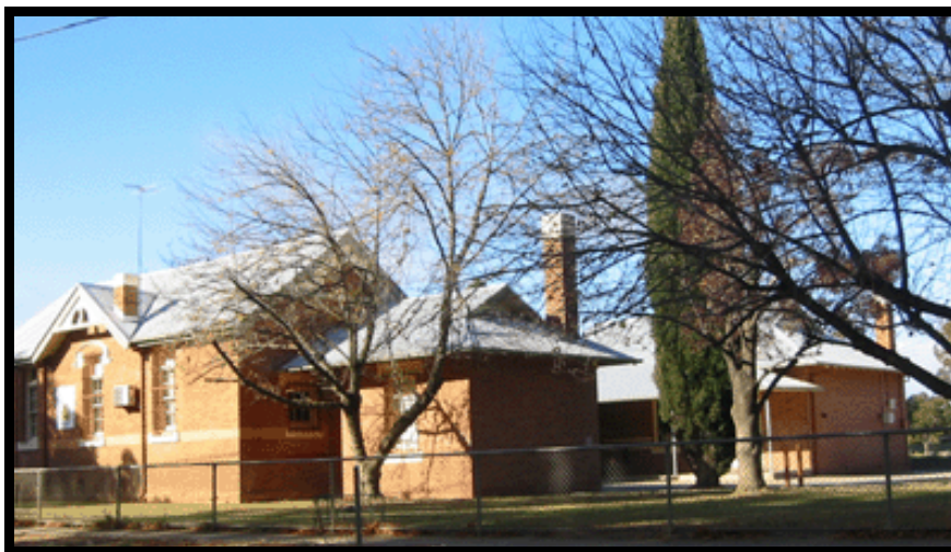
Fig 9 The school rooms on Bromley Street.