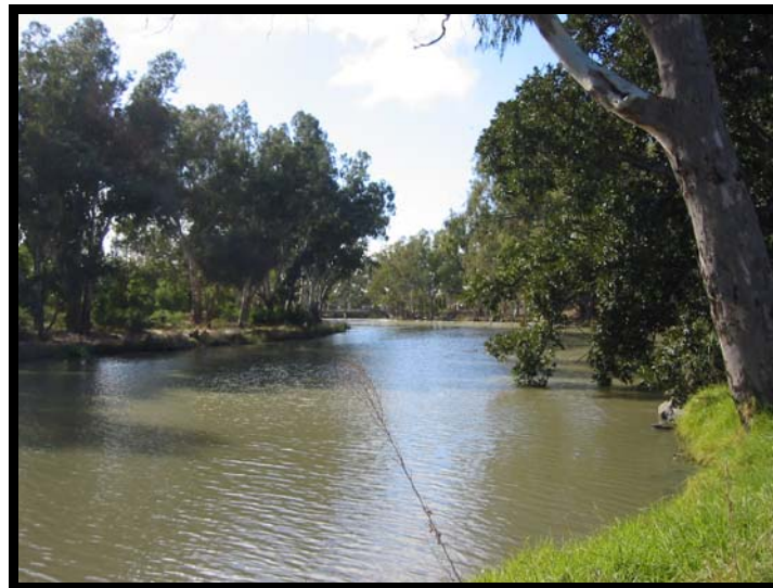
Fig 5 View east along Broken Creek showing the tree lined banks.