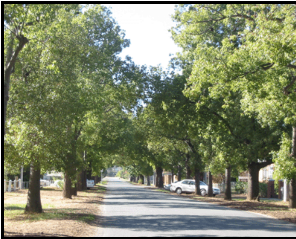
Fig 6 Great War Avenue of Honour, Bromley Street.

The Great War of 1914-18 took a heavy toll on Nathalia, with 35 men from the district killed out of nearly 200 recruits in the area. The end of the conflagration in Europe brought both celebration and sadness, as well as hardship for returned soldiers and the families of those who had died or been injured. The avenue of honour was a typical tribute to the fallen, and each of the trees was given a plaque with a name of each of those men. Each of the Kurrajong trees in Bromley Street, whence the precinct's name is derived, was individually named. 8