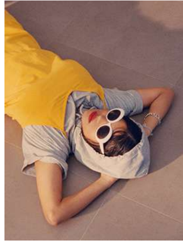
The H&M group aims to reduce electricity consumption and to use only renewable energy. Above: campaign by Monki 2017. Left: COS store in Mall of Scandinavia in Solna, Sweden. Below: production of COS shoes at a supplier in Portugal. Far below: supplier information at arket.com