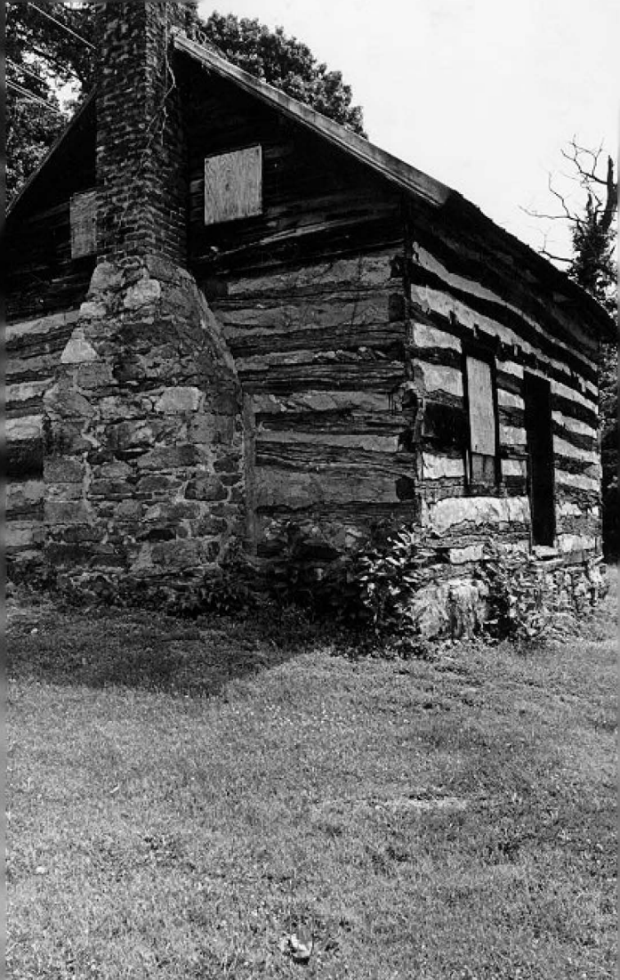
Many early homes were log cabins chinked with clay and water.