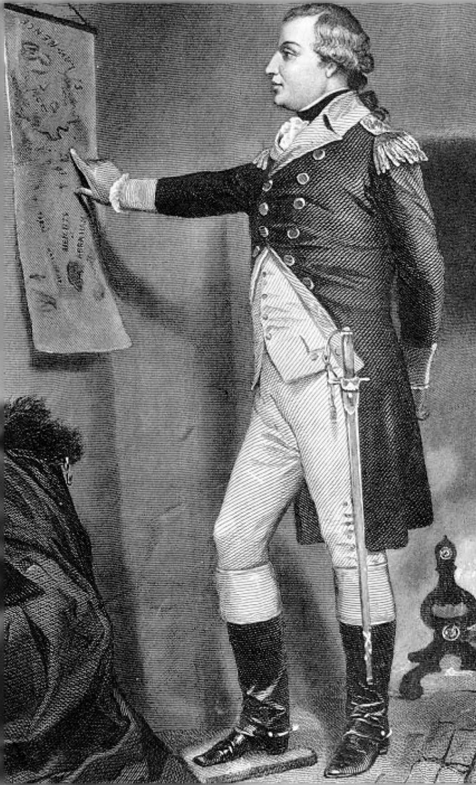
General Richard Montgomery