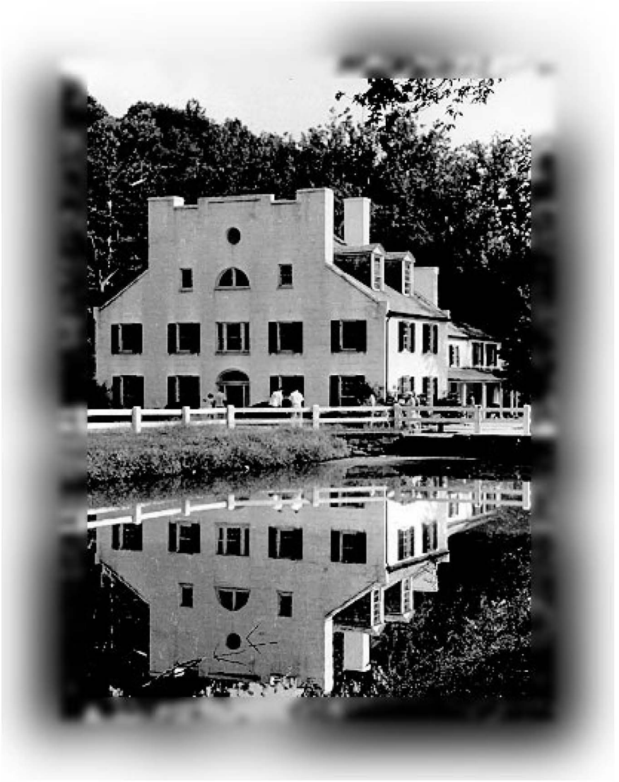
Great Falls Tavern on the C&O Canal now serves as a visitor's center.