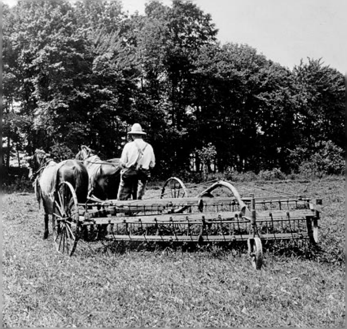
Raking hay on a Sandy Spring, Maryland farm.

charter advocates was recognized when Montgomery County was the first county in the nation to be honored as an “All America” municipality. Previously only cities had received the award.