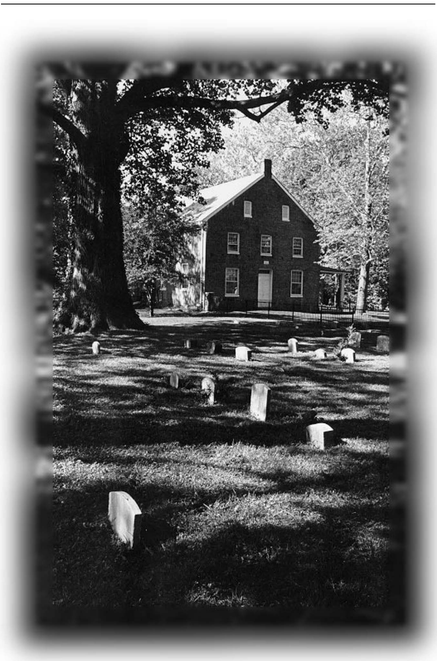
Friends Meeting House at Sandy Spring.