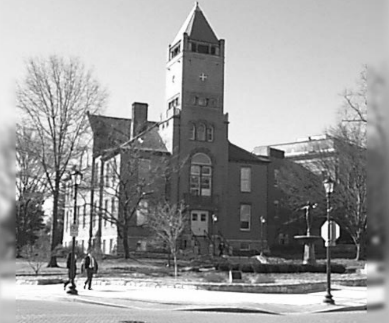
Red Brick Courthouse, Rockville, Maryland.