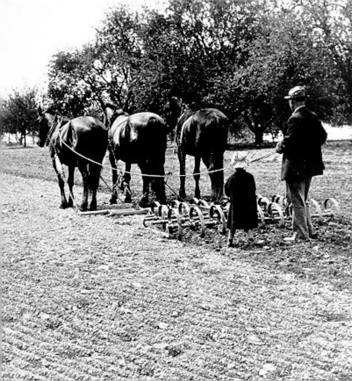
Preparing ground for wheat on the Snyder farm in Travilah.