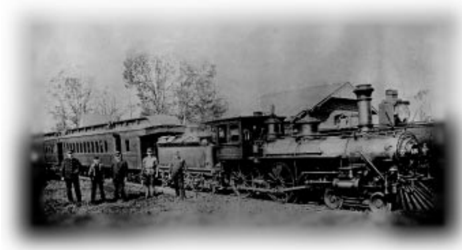
Gaithersburg train station in 1890.

Throughout the war, both sides sometimes plundered the countryside, stealing horses and food. Much of the wooden fencing in the County reportedly found its way into army campfires. A prominent County resident, Montgomery Blair, served as Lincoln's postmaster general during the War Between the States.