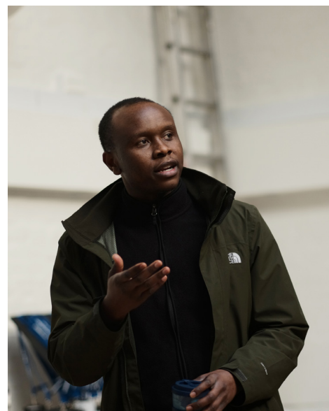
Ben Chaplin; Seána Kerslake; Kurt Egyiawan