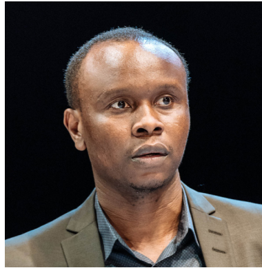
MILES Cat's Lawyer