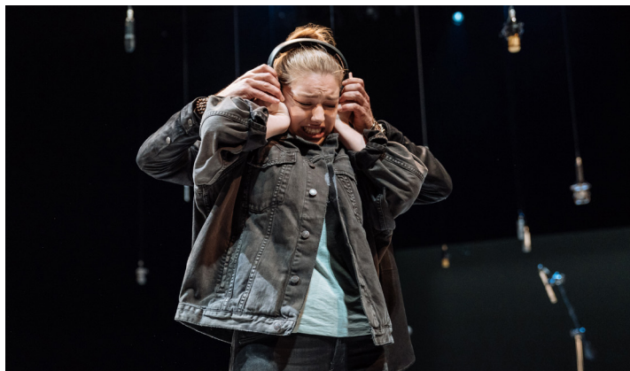
Seána Kerslake; Jemma Redgrave

Or plucking notes, most often on stringed instruments.