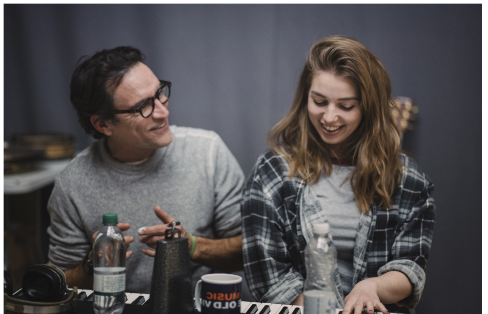
Neil Stuke; Ben Chaplin; Seána Kerlake