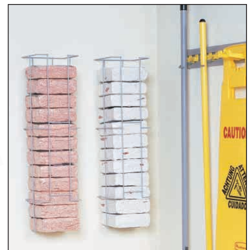
Wall-mounting mop dispenser, as shown, holds 16 small, 13 medium, nine large or eight extra-large wet mops.

Innovative packaging helps solve problems related to storage and disposal of unwieldy mop cartons. Certified by the International Safe Transit Association to help improve the assurance of the safe arrival of Compact Mops at their destination.