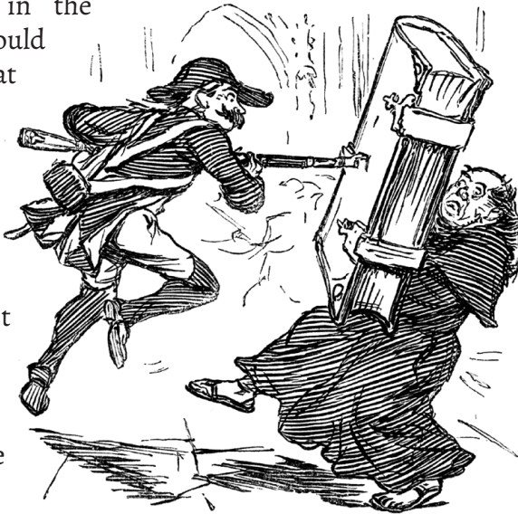
This paper looks to me as if it KNEW what a vicious influence it had!

So I object to his logic, even if that makes me “objectively wrong,” for I believe that even if we accept the salience of numbers and impartiality in areas like science, we should reject that ethics should work in the same way. We should reject the notion that we can quantitatively determine the most serious forms of suffering through an algorithm, and that ideal moral thinking should consist of nothing more than our pursuit of this end. I wholeheartedly protest against the