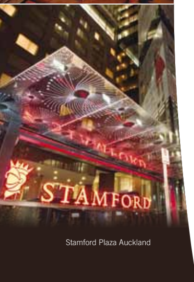
Stamford Plaza Auckland