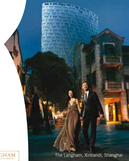
The Langham, Xintiandi, Shanghai

Conditions: To receive bonus miles, guest must be a member of Starwood Preferred Guest®, have selected Royal Orchid Plus miles as currency of choice at time of stay and present the Starwood Preferred Guest card at check-in. Advance reservation is required. Credit card will be charged at time of booking. Any unused portion/s of the offer inclusions is not transferable to other dates or refundable as cash/credit. Cannot be used in conjunction with any other offer or promotion including Starwood Privilege. A limited number of rooms may be available at these rates and additional restrictions and blackout dates may apply. Not valid for group bookings. Void where prohibited by law. Not responsible for omissions or typographical errors. Starpoints, SPG, Starwood Preferred Guest, Sheraton, Four Points, W, Aloft, Le Méridien, The Luxury Collection, Element, Westin, St. Regis and their respective logos are the trademarks of Starwood Hotels & Resorts Worldwide, Inc., or its affiliates. © 2011 Starwood Hotels & Resorts Worldwide, Inc.