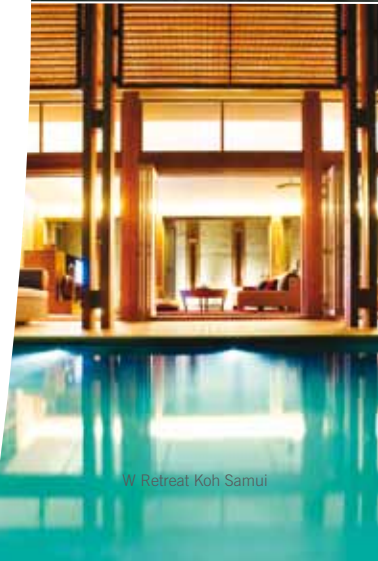
W Retreat Koh Samui