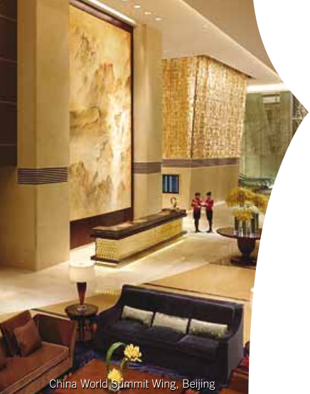
China World Summit Wing, Beijing