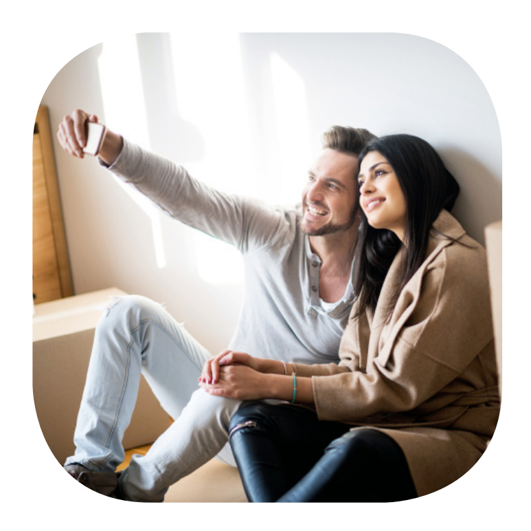
Are your cluster descriptions more than a couple years old? They may be obsolete, especially if the focus is on Millenials and their technology behaviors.

Mosaic USA offers a common customer language to define, measure, describe and engage target audiences through accurate segment definitions that enable more strategic and sophisticated conversations with consumers. Using Mosaic USA lifestyle segmentation, marketers can anticipate the behavior, attitudes and preferences of their best customers and reach them in the most effective traditional and digital channels with the best messages and digital channels with the right messages at the right times.