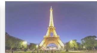
Paris, France July 8 - 15, 2017