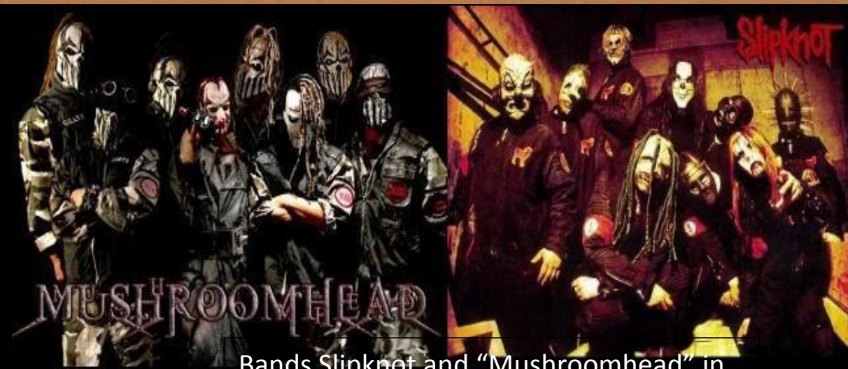
Bands Slipknot and "Mushroomhead" in a side by side comparison.

An addition to that fact is the first official name this band went by, BEFORE "Slipknot," was "The Pale Ones." In my opinion, they've definitely improved their name.