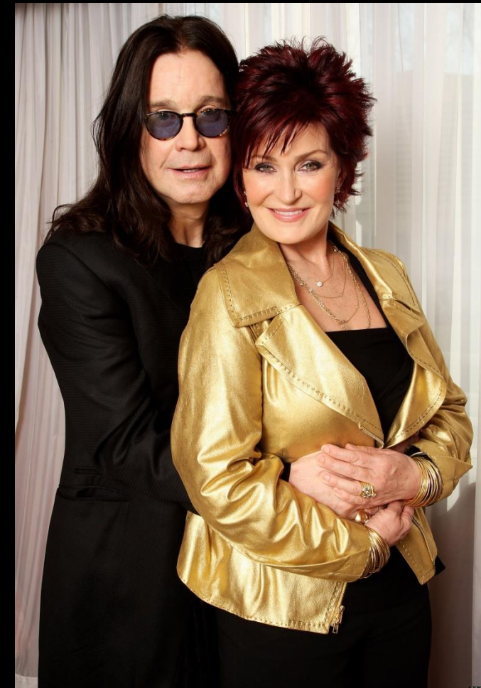
Ozzy and his wife, Sharon Osbourne

Ozzy isn't a man you'd want to mess with finically, him and his wife were ranked #458 richest couples in the UK according to "Sunday Times Rich List" in 2005. They have an estimated £100 million earned from recording, touring and TV shows.