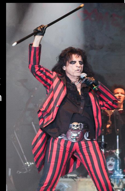
Alice Cooper performing live at Wembley Arena in 2012