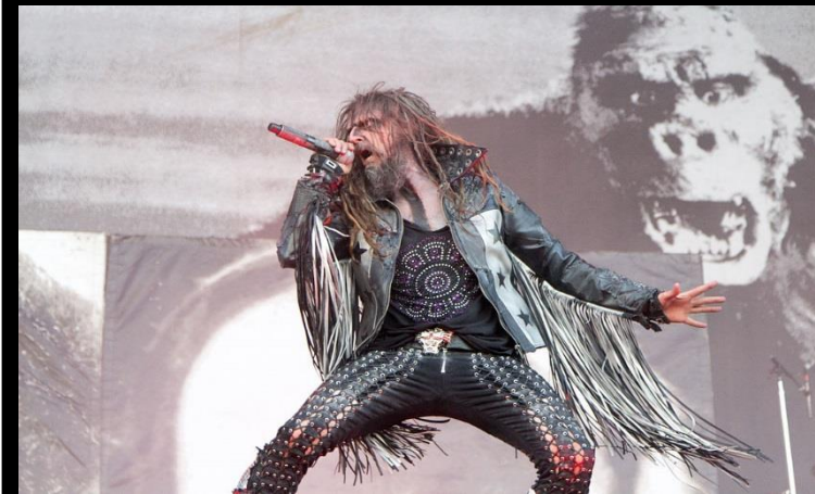
Rob Zombie at "Nova Rock 2014"