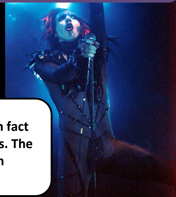
Marilyn performing during the "Mechanical Animals Tour."

"When all of your wishes are granted, many of your dreams will be destroyed."