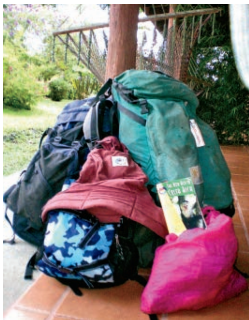
Right: What the Lancasters took to Costa Rica: three backpacks, an Ergo baby carrier, a stuffable bag, and a guidebook

For family use, we included one first-aid kit, a bag of toiletries (but no makeup or frills), a camera and charger, a journal full of paper (for artwork and writing), and a sarong (for use as a towel, changing pad, skirt, or blanket). A ziplock bag encased our passports, credit cards, and travel documents, as well as our Costa Rica guidebook and Spanish/English dictionary, which would surely be in constant use.