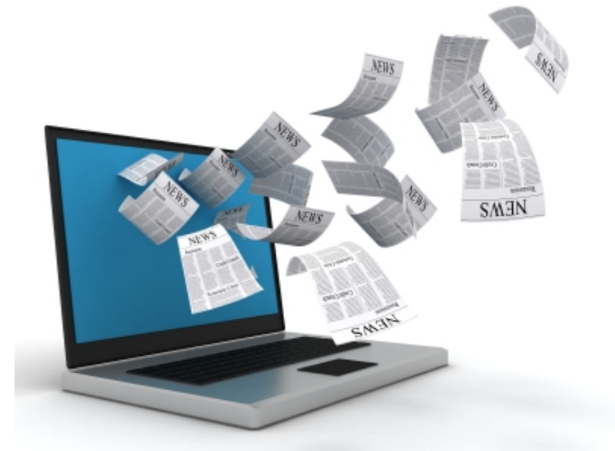
Illustration: alexsl/ iStockphoto.com