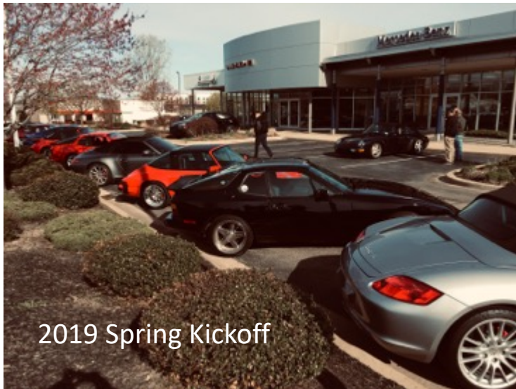
2019 Spring Kickoff